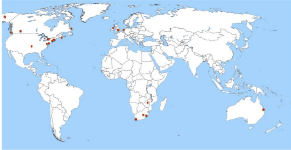
Figure 2: Geographical location of digital storytelling projects and participants.