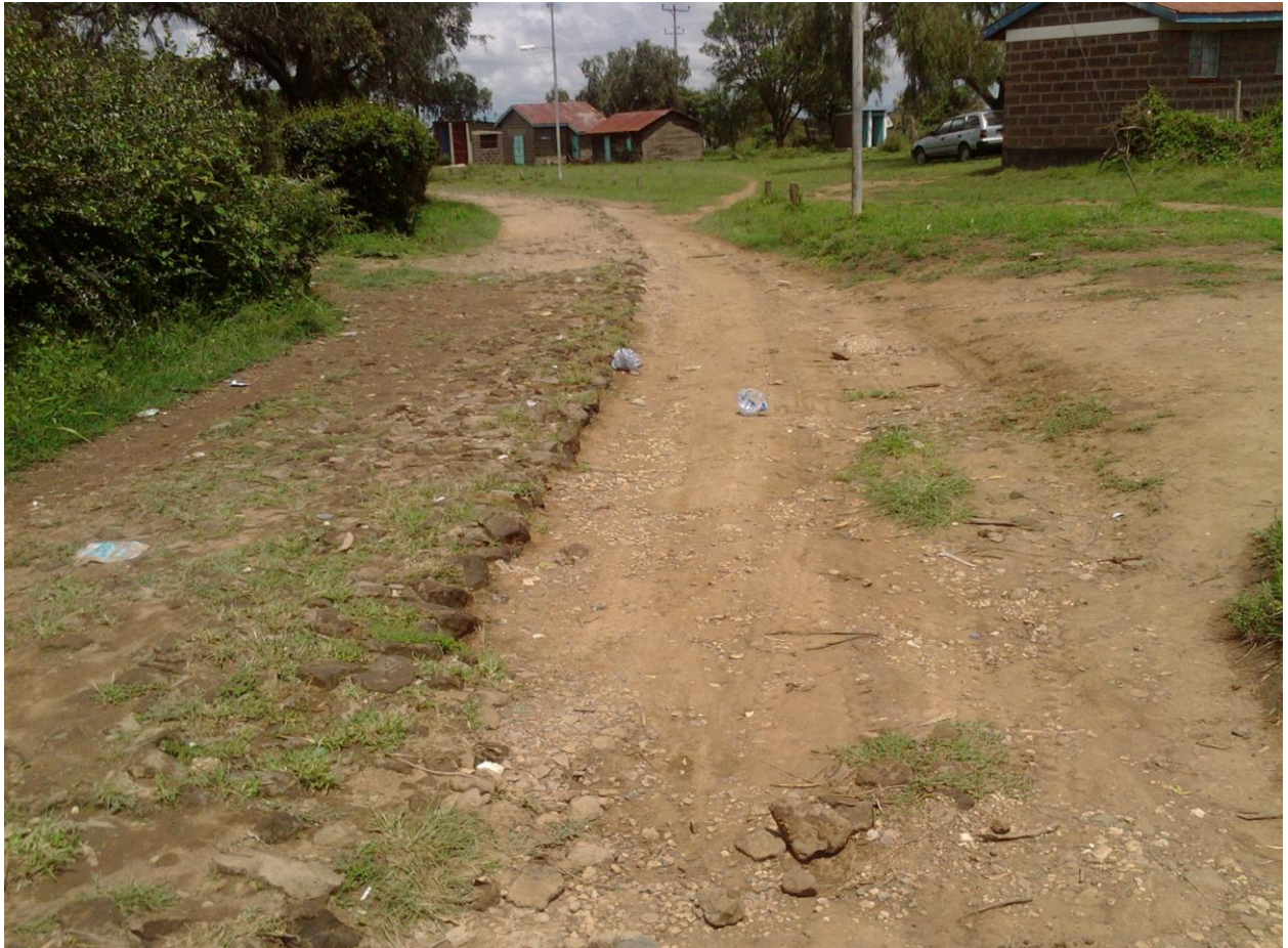
Figure 6. Jonas' picture of proper road maintenance. (June 26 th , 2012). His narrative reads, "I took a picture of proper road maintenance that controls soil erosion."

In a different way, David documents context when providing historical context to his picture. In this way, he is situating the context in a broader sense—a context that is dependent on understanding how the pastoral people of Africa have changed due to land adjudication practices and colonialism.