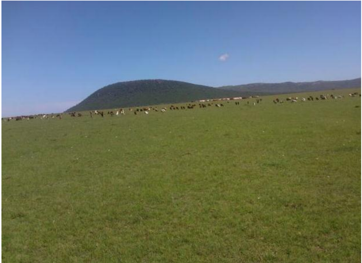
Figure 10. Mary's picture of overstocking (May 27 th , 2012). Her narrative reads, "I chose this picture because from it I learnt that overstocking can lead to environmental disasters as it results to overgrazing, which leads to reduction of vegetation cover hence rapid soil erosion which results to gulley. Soil erosion reduces crop yields. Reduction of vegetation cover leads to droughts, which in turn leads to mass deaths of wild and domestic animals. Man suffers a great loss as famines persist as a result of poverty and lack of food. Tourism activities also decline. As a result of poverty, crimes increases, which in turn might lead to civil wars making the earth, unfit to live."

In addition to viewing the participants' knowledge, this methodology afforded opportunities for the participants to document what is of critical importance to them.