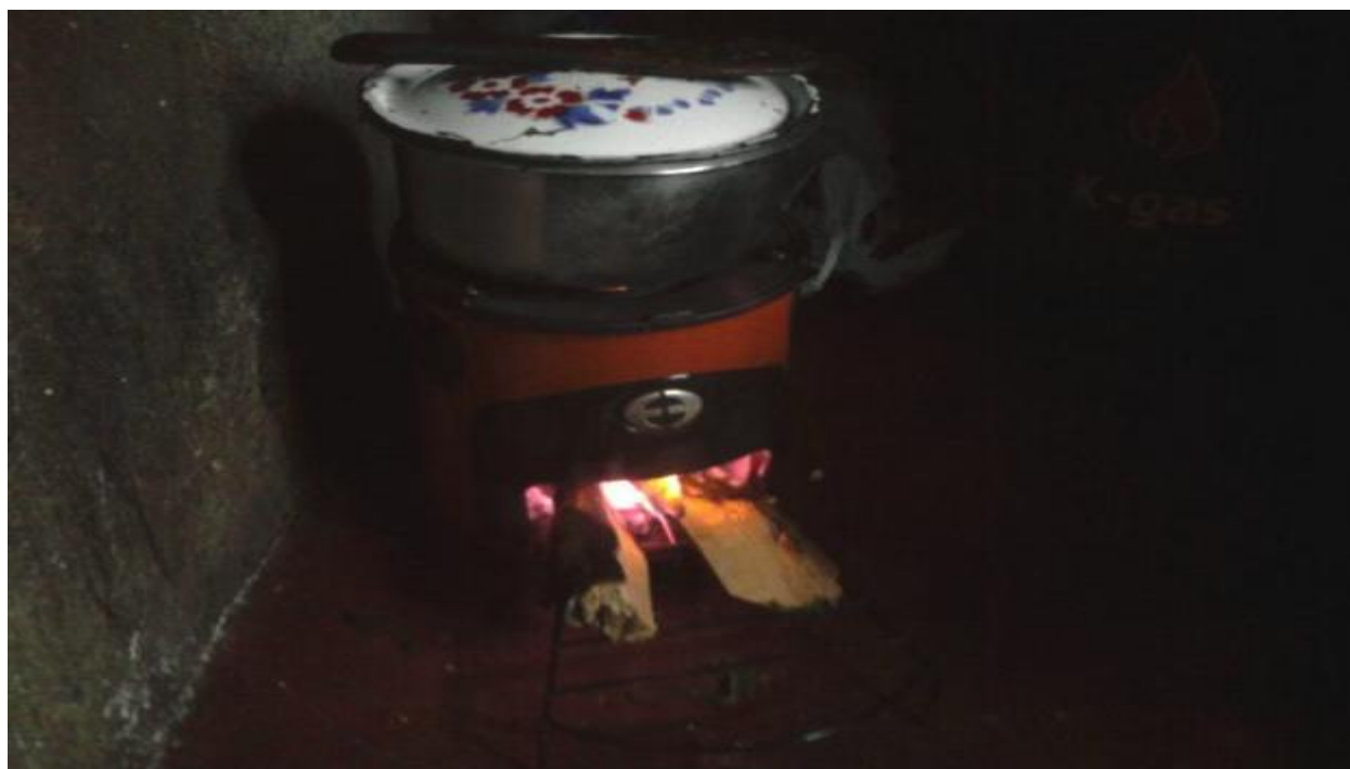
Figure 4. Nina's picture of a jiko (a stove that uses less wood than a typical wood-fired stove). Her narrative reads, "I got interested in this jiko because of its conservative nature. Since most people in Kenya uses firewood for cooking, this jiko uses very few pieces of firewood to cook hence avoiding felling down of trees thus conserving the environment."