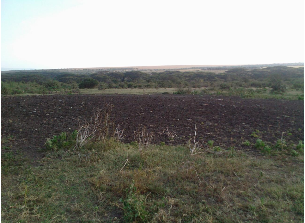
Figure 7. David's picture of cow dung (July 8 th , 2012). His narrative reads, "For hundreds of years, the movement of pastoral people across East Africa rangelands ensured a constant redistribution of nutrients. As seen in this picture, heaps of cow and sheep dung are deposited outside most homesteads for years due to families settling down following privatization of land. Most families have no idea that the heaps are full of minerals needed in pasturelands. Typically a grazing cow sheep or goats goes out into the plains and for 8 hours eat leaves and grass. Upon chewing, the dung is deposited in the kraal and later swept outside to sit idle for years. By doing so, and unknown to many, the drylands are becoming poorer and unable to support the pastoral people."