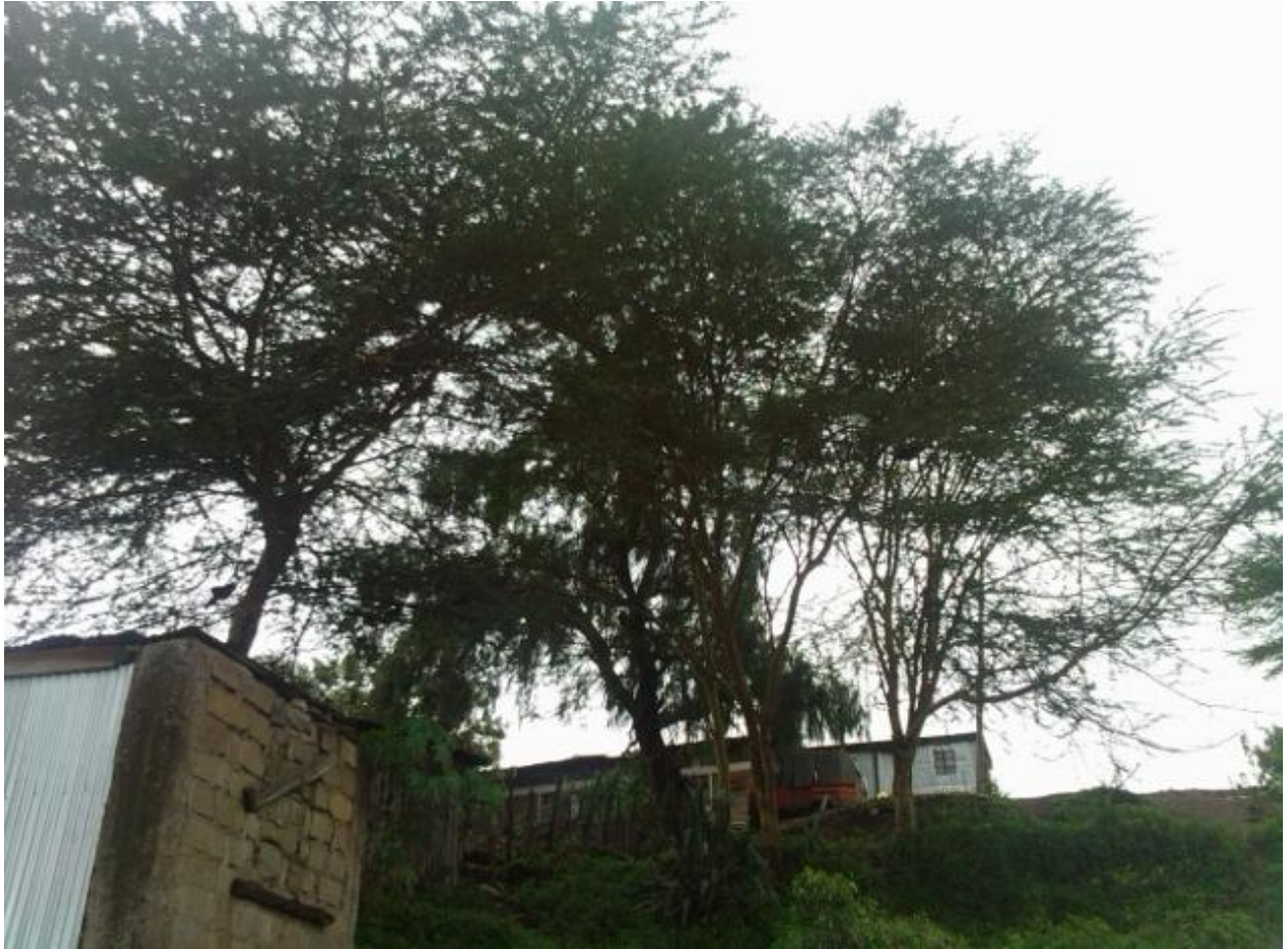
Figure 3. Catherine's picture of Acacia trees. (June 7 th , 2012). Her narrative reads, "These trees grow in semi-arid areas. They have roots, which go deep into the ground in search of water. When they grow near the riverbanks they can dry up the river leading to drought. On the other hand they are a source of fuel to many homesteads because the trees are burnt to produce charcoal."

The idea of cooking fuel was of high interest to the participants in terms of frequency of the pictures submitted. Here, Nina describes how jikos help to conserve the environment because they use less firewood than other types of wood-burning stoves. Through the use of photovoice, Nina shared her local knowledge on these stoves and how they can reduce the amount of deforestation from felling trees for firewood.