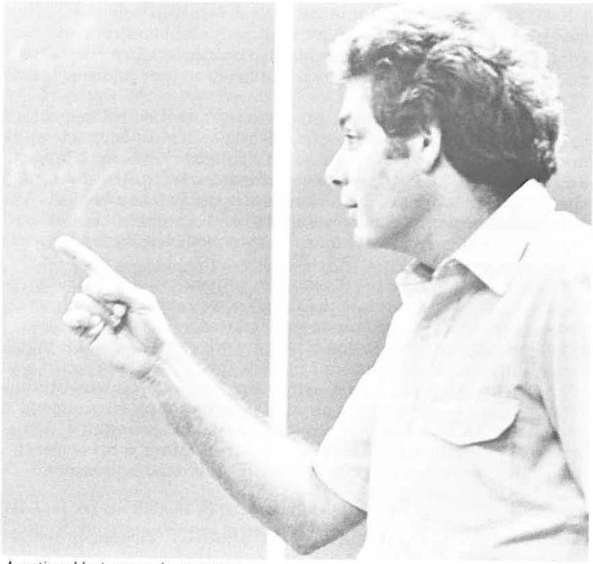
A national lecturer making a point