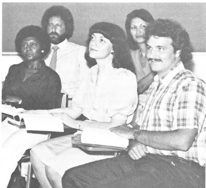
An informal study session at a cluster site

REGIONAL CLUSTERS Regional clusters were developed specifically for those students who, because of location or employment considerations, are unable to participate in local clusters programs. Regional clusters have been designed to enable students to complete all requirements for the Ed.D. degree without taking extensive leave from their positions of employment.