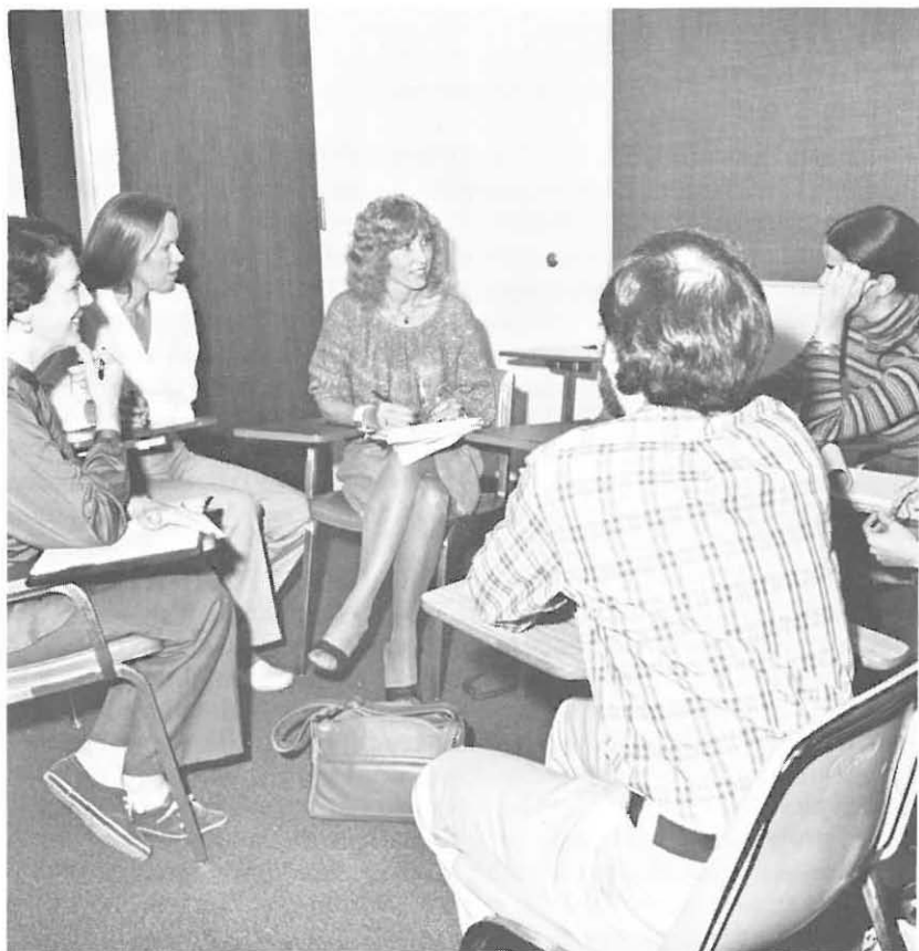
Students in one of the seminar meetings

University, and forging or altering University documents or academic credentials.