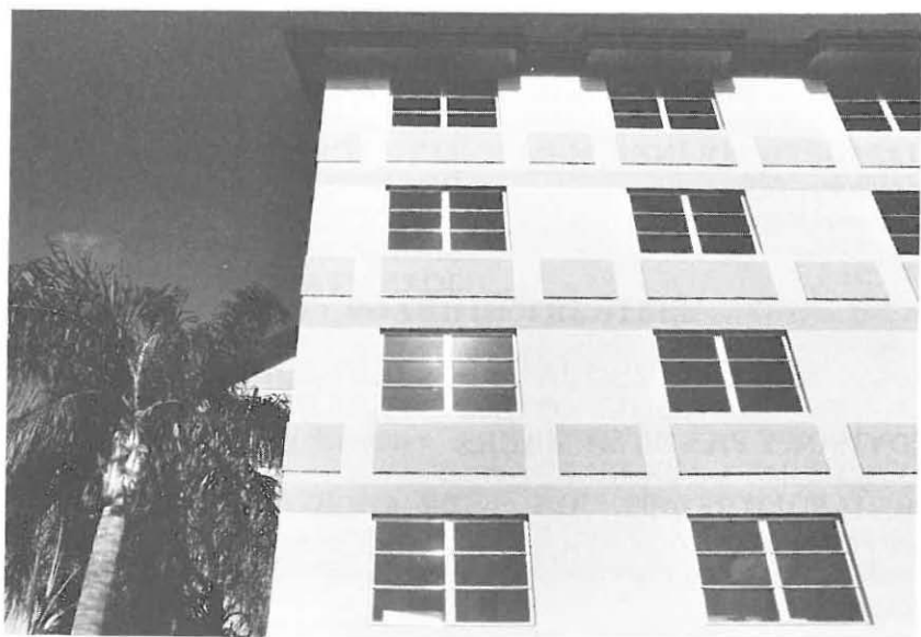
The new student housing facilities

NOVA UNIVERSITY is an independent, nonsectarian, nonprofit, university chartered by the State of Florida in 1964. It is located on a 200-acre main campus west of Fort Lauderdale at 3301 College Avenue, with additional locations in downtown Fort Lauderdale and Coral Springs and at Port Everglades. Its nine centers of study offer campus-based undergraduate and graduate programs leading to degrees in education, law, the behavioral sciences, computer sciences, and business and public administration. As an acknowledged leader in field-based postsecondary education, Nova offers programs of study leading to the bachelor's, master's and doctoral degrees in education, in business and public administration, and in the behavioral, social, and computer sciences.