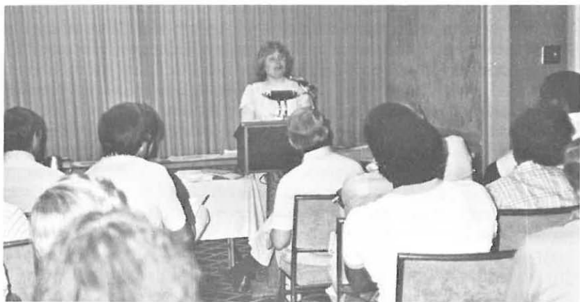
A concurrent session at one of the summer institutes

A grade of UNACCEPTABLE means the practicum needs revision. When a practicum receives an UNACCEPTABLE on the second revision, a NO PASS is assigned and the student must begin a new practicum on a new topic.