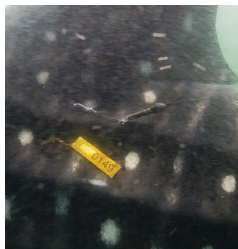
Tags showing on a young whale shark

Ecotourism for whale sharks has exploded across the globe. The magnificence of such large, distinctive animals, coupled with their calm demeanor and their feeding biology, which differs greatly from other sharks, makes them a huge attraction for dive operators. Snorkelers can safely approach and encounter these friendly creatures and many are moved to awe by their size and beauty. However, whale sharks are highly migratory, and unfortunately, still the victim of targeted fisheries in some areas of the world. At the last CITES conference, the whale shark was listed on Appendix II, meaning that it must be monitored and managed properly, but is not yet fully protected. Hopefully, whale sharks will be fully upgraded to Appendix I at the next conference and all international trade in whale sharks will be banned. 🐟