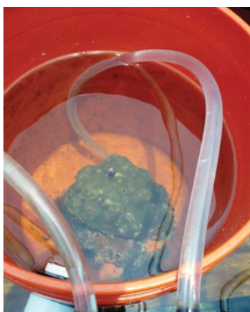
A top-down view of "parent" Porites astreoides coral

The coral husbandry system, which has made captive coral spawning a possibility at the NSUOC, is composed of four large raceways holding more than 450 gallons each, a 500-gallon holding tank, and a 10' tall protein skimmer. The system was fabricated and constructed over the past few months by Alison Moulding , Ph.D., and research assistants Abby Reneger and Adam St. Gelais .