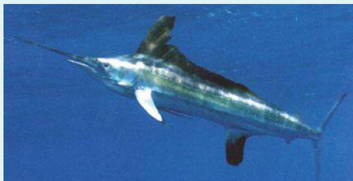
White Marlin

NSUOC's research has been reported in worldwide media (Germany, the United Kingdom, South Africa, Canada, and Romania), including prominent U.S. venues such as The Washington Post , National Public Radio ( All Things Considered Show), and Science magazine. 🐟