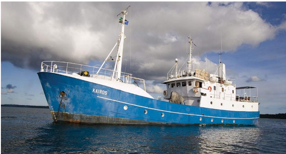
The M/V Kairos

Whale sharks have been discovered to aggregate in Kilindoni Bay off of Mafia Island, the southernmost island of the Zanzibar Archipelago in Tanzania. The island sits offshore from the Rufiji River delta, and the nutrients from the river runoff must collect in this area and feed the thick, green soup of phytoplankton that is prevalent in this area. Whale sharks are filter feeders, and migrate over huge distances, stopping in strategic spots to feed. They apparently discovered this veritable bonanza of plankton and started to exploit the resource as a stop in their travels. All the sharks here are juveniles, with individuals ranging in length from roughly 3 to 8 meters. While these are not small animals, the whale shark is the largest fish