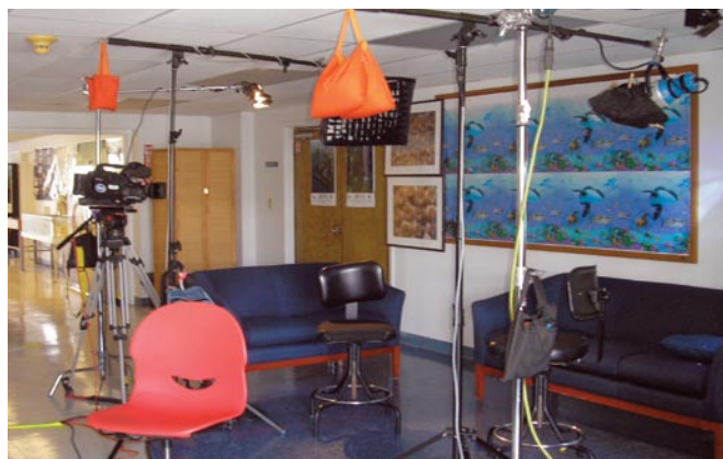
The interview equipment being set up in the lobby of the OC