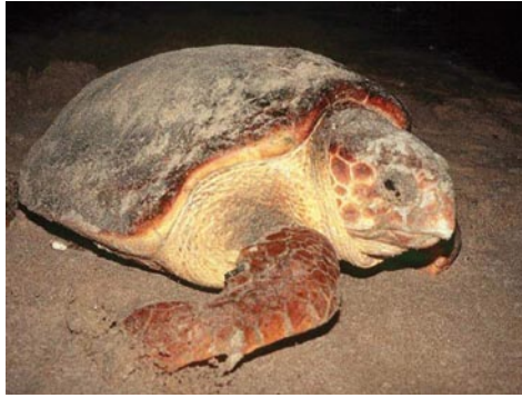
Female loggerhead sea turtle

The Broward County Sea Turtle Program promotes the conservation of sea turtles and their protection on Broward's nesting beaches, as well as the marine