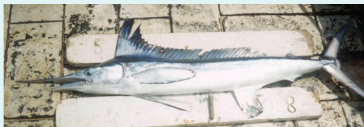
Roundscale spearfish

Many of the media reports are available on the Guy Harvey Research Institute Web site: www.nova.edu/ocean/ghri/ .