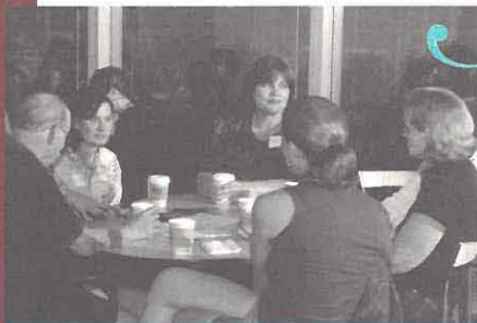
With book clubs growing in popularity across the nation, NSU's "Books Over Biscotti" program gave summertime reading a big boost.