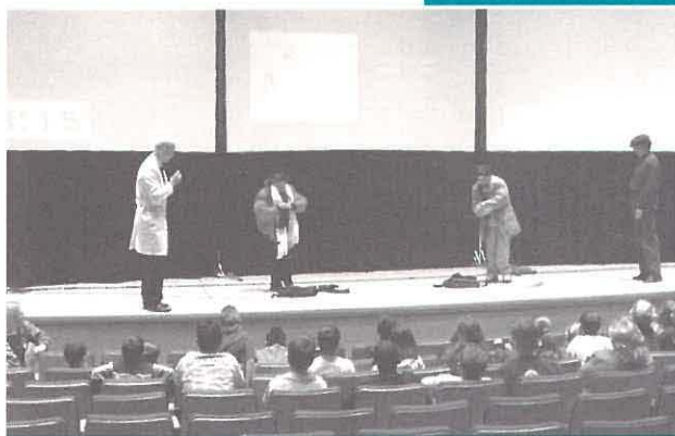
Every year since 1989, the JASON Project offers students from grades three to nine opportunities to participate in scientific research through live interactive broadcasts.

NSU's Oceanographic Center works directly with Ballard on the JASON