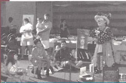
Children and their parents enjoyed the antics of Tootsie the Clown during a summer program at the NSU Library.

The NSU Library, Research, and Information Technology Center offers community programming for adults, young adults, and children.