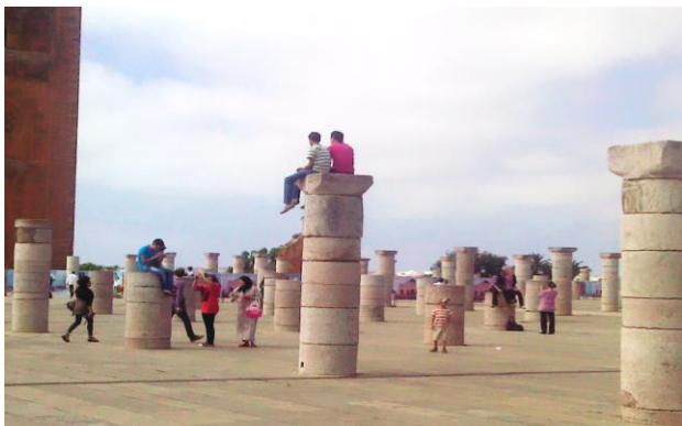
King's Castle Grounds

Topics covered will include various levels of peace building programs (government, civil society), social change, peace education and human rights. As part of the course students will travel to a specific global practicum locale (in this case Morocco) for approximately fourteen days (including travel) where they will have the opportunity to interact with and learn from leading government and civil society peace builders in country. Such in-country partners will include government officials, such as from the Foreign Ministry and/or the Ministry of Education, US diplomats in country, and civil society organizations relevant to peace building and peace education in country. The course will also include an online component, which will include weekly "elive" (Elluminate) chats and discussion board dialogue. The purpose of this component will be to organize and communicate class logistics, provide lecture and discussion of course texts, and introduce students to content specific to peace and conflict in country. *Please contact Dr. Duckworth, cheryl.duckworth@nova.edu , for registration.