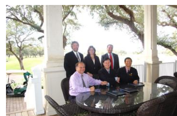
SHSS welcomes Beijing Normal University