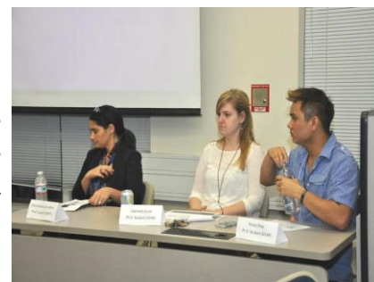
SHSS Symposium Winners