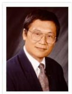
From the Dean's desk