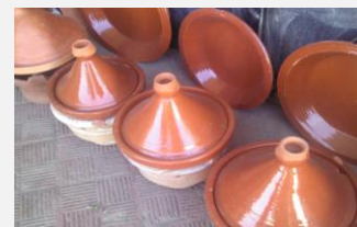
Moroccan Tagine Cookware