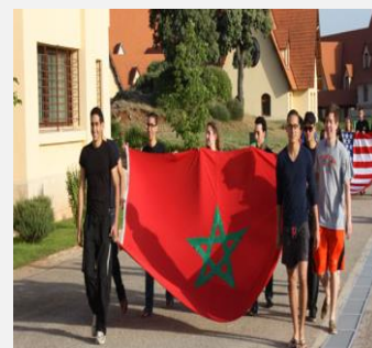
Al Akhawayn University Students