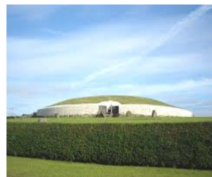
Bru Na Boine/Newgrange