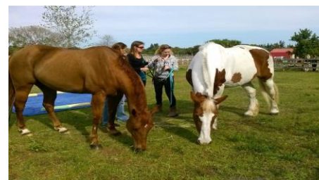
Equine Therapy students collaborating with each other