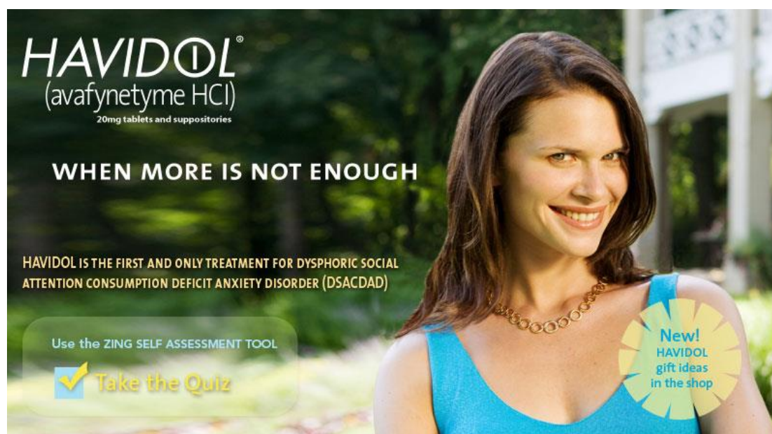
Figure 1 ( http://www.havidol.com/ reproduced as ‘fair use’)

The Havidol parody is an artist’s impression of drug promotion and a commentary on the role of medicines in contemporary social life. However, the art work also shows an element of the disease mongering critique that is often left implicit in academic writings. While the Havidol parody, like the wider disease mongering critique, is clearly aimed at drug companies, the artist made it clear that the parody extends to us all and the “culture of consumerism” and pursuit of “a life without pain, only gain” (Mahmood, 2007). The caption “When more is not enough” suggests that the seller is pitching to a grasping public, never satisfied, always wanting more.