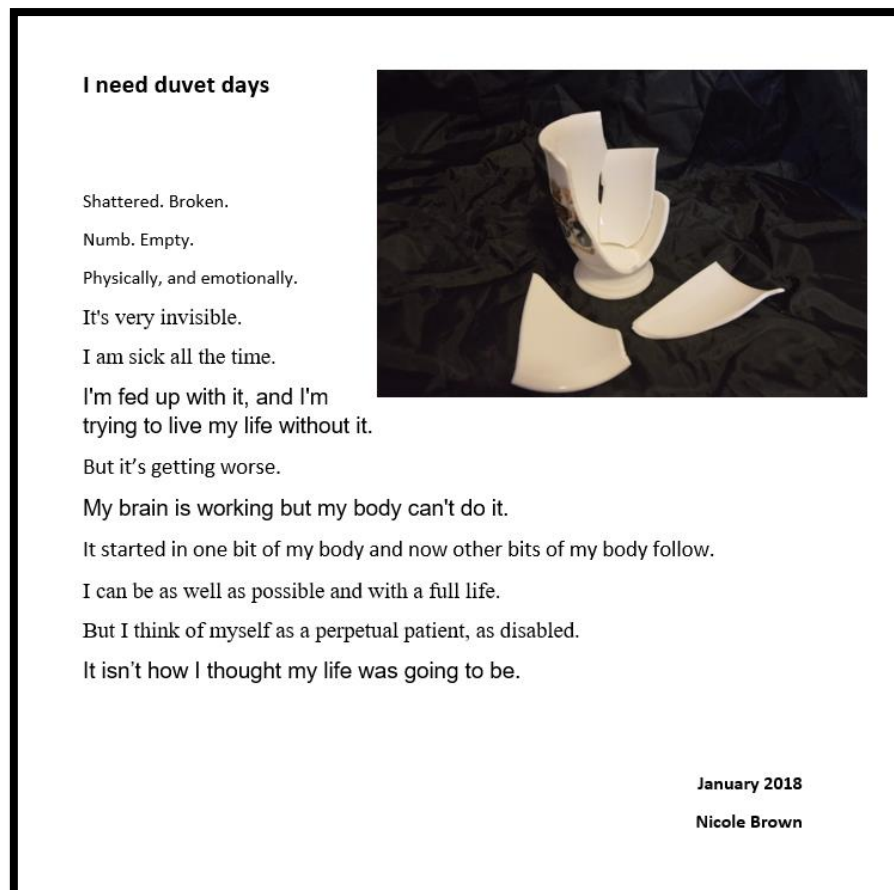
Figure: I need duvet days

By the end of the process, this illustrated poem had become a helpful tool for me to make sense of participants' experiences, whilst at the same time participants felt that they were able to demonstrate and show their feelings. However, they felt that the illustrated poem required a certain pre-understanding in order to be able to fully comprehend its meaning. I therefore sought to explore a different approach to analysis and created the art installation Peace Treaty , which participants felt allowed for better engagement with life with fibromyalgia for those who do not have any prior knowledge.