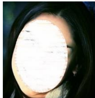
Figure 1: Golab's profile picture

Figure 1 shows Golab's current profile picture on Facebook with her face covered to protect her identity. This photo is limited to her face circle to make it hardly recognisable whether she has head cover or not that seems to be a sign of personal dilemma in online presentation of self.