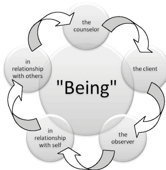
Figure 1. A diagram of the emergent themes from the study.

To capture this experience in textual description the word being was selected. In listening and reviewing transcripts it seemed as if participants experienced live supervision in a way that contributed to greater understanding of the roles of counseling (client, counselor, observer), but also contributed to greater understanding of how counseling would have a profound impact upon their personhood and subsequent relationships. Participants stories were saturated with the notion of being immersed in the role and experience of the counselor whether they were doing the counseling, acting as client, or observing.