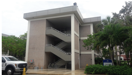
FARQUHAR RESIDENCE HALL

This student center is full of interesting and important places like the Rick Case Arena, Shark Fountain, RecWell gym, leisure pool, Office of Campus Life and Student Engagement, Shark Store, Flight Deck Pub, Outtakes, and food court. The Performing and Visual Arts wing and Black Box Theater can be located in this building as well.