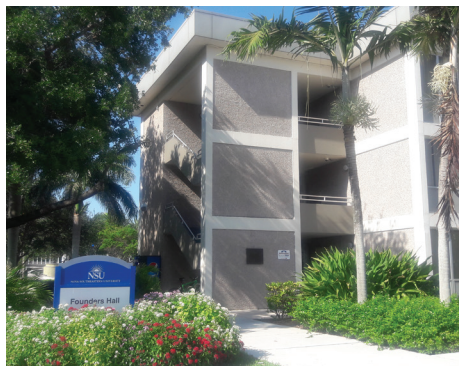
FOUNDERS RESIDENCE HALL