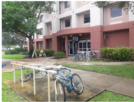
LEO GOODWIN SR. RESIDENCE HALL

If you're planning on attending graduate school for law, this is where you will attend the Shepard Broad Law School. The building has its own library and food kiosk as well.