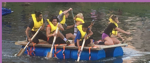
The annual "Anything That Floats" Raft Race brings NSU together while students navigate on their creations.

Homecoming is a great event for students who love to dance. Taking place in November, homecoming takes place in a local club rented out by the university for a night.