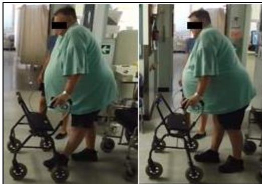
Figure 4. Walking