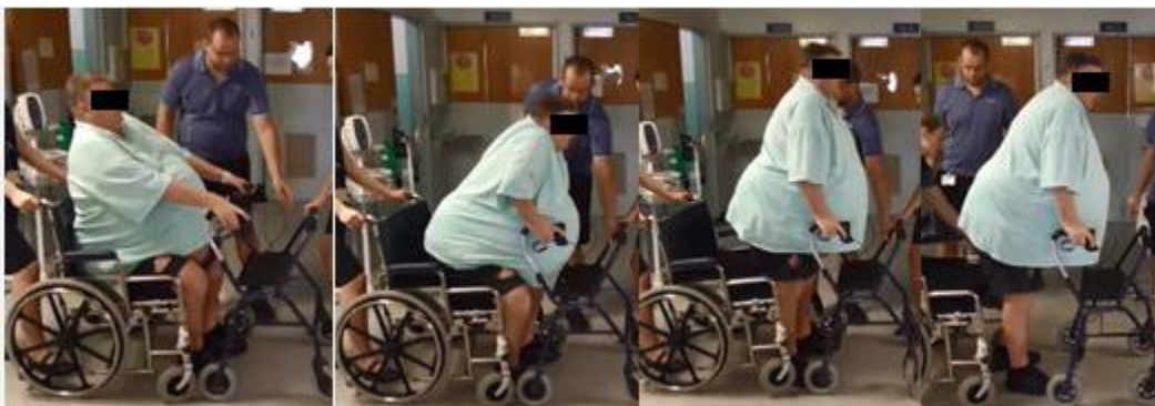
Figure 3. Transferring from sitting to standing.

From this point, he then practised sit-to-stand from the chair, with the tilt-table in front of him, using his hands for support on the tilt-table, and then progressing to standing up next to his bed whilst holding the bed-rails for support, and then standing up from different chairs at progressively lower heights (e.g. commode, wheelchair) (see Figure 3). Approximately one month after commencement of the tilt-table mobilization program, he walked for the first time in nine weeks, initially managing two walks of 8 metres, using a four-wheeled walking frame (see Figure 4). Once he was able to stand independently, transfers back to bed were based around his preferred semi-prone position, achieved by him using his arms to support himself on the bed, and essentially climbing onto the bed (see Figure 5).