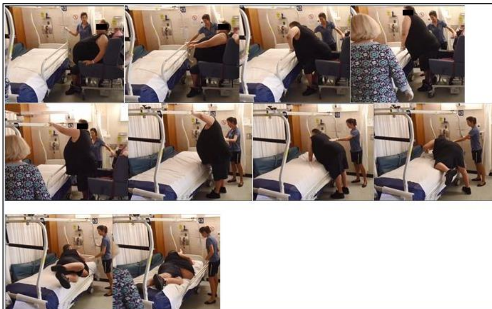
Figure 5. Transferring from chair to bed.

A summary of his functional progression, based on the Intensive Care Unit mobility scale 11 and Functional Independence Measure (FIM), both calculated retrospectively, are shown in Table 1. His motor and total FIM scores improved by 30 points from admission to discharge, which exceed the minimal clinically important differences reported for the stroke population. 12