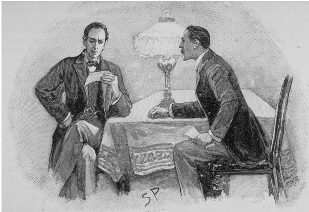
Sherlock Holmes (left) reading to Dr. John H. Watson the coded message that caused Victor Trevor Sr. to have a stroke (illustration by Sidney Paget, from The Strand Magazine (April 1893))

cold feet. 13 The note's sender is Trevor Sr.'s former shipmate and fellow mutineer Evans, who now uses the name Beddoes. 14