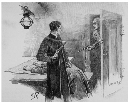
A mutineer, disguised as the ship's chaplain, holding the still-smoking gun he used moments earlier to kill the Gloria Scott's captain (a second mutineer can be seen standing in the doorway) (illustration by Sidney Paget, from The Strand Magazine (April 1893))

Non-Sherlockians, however, have found the story useful in helping explain to doctors how to diagnose stress; 28 academicians how to recognize plagiarism; 29 lawyers how to conduct investigations; 30 writers how to craft radio scripts; 31 and “foodies” why they enjoy cured meat. 32 The story also is recognized as having coined the phrase “smoking gun” to denote indisputable evidence