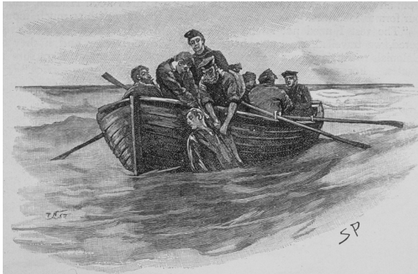
Seaman Hudson being rescued (illustration by Sidney Paget, from The Strand Magazine (April 1893))

vessel that sank off the coast of Africa and are accepted as such. Upon reaching Sydney, they find work as gold miners, grow rich, and later return to England using their assumed identities.