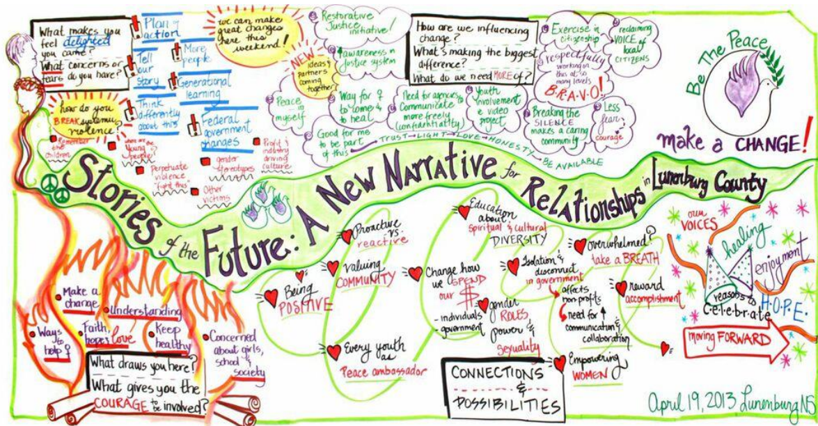
Figure 1: Stories of the Future.

This graphic depiction captured the need for change and the vision for a more peaceful future expressed by participants. It highlighted the hope and energy of community participants that felt a need for a new narrative to inform relationships in Lunenburg County, and a belief that such change was possible (Be the Peace, 2013).