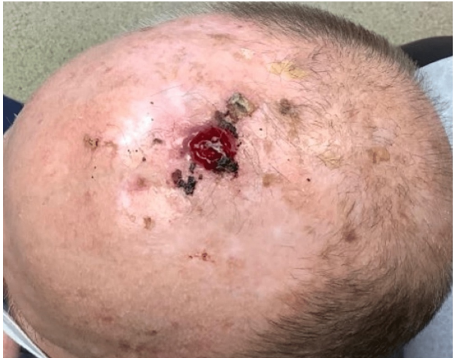
FIGURE 1: Ulcerating SCACP lesion on the mid-frontal scalp.

for an evaluation of a suspicious skin lesion located on the mid-frontal scalp (Figure 1). Upon gross examination, a 1.6-cm by 1.6-cm erythematous and tender nodule was seen with an associated hyperkeratotic scale. According to the patient, the lesion first appeared several months ago and had never been addressed before. The patient's past medical history was significant for basal cell carcinoma, squamous cell carcinoma, and asteatosis cutis. Given such a strong predisposition to developing skin cancers, a shave biopsy was performed to rule out an invasive squamous cell carcinoma. Based on an independent review by a pathologist, histopathology revealed a malignant papillary neoplasm with features of SCACP (Figures 2, 3). Immunostaining further revealed strong positivity for p63 and CK5/6 markers, with focal reactivity for CK7 and CEA. The KI-67 tumor proliferation index was also considerably increased, but an absence of GCDPF-15 expression was noted. The diagnosis of an invasive SCACP was established. Mohs surgery was offered to the patient considering the anatomical location of the tumor. The lesion was excised in two consecutive stages, with the final excision measuring 3.2 cm by 2.8 cm. The patient was seen for a follow-up visit four days post-operation and had not yet presented with any new skin changes.