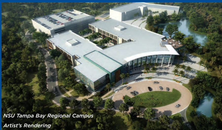
NSU Tampa Bay Regional Campus Artist's Rendering

Welcome to Tampa Bay. Situated along Florida's Gulf Coast, this region boasts an enviable quality of life with year-round sunshine, a unique cultural heritage, and a diverse business climate. For individuals and companies alike, the Tampa Bay area offers accessibility, affordability, and opportunity.