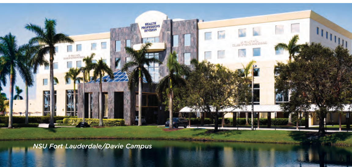
NSU Fort Lauderdale/Davie Campus

NSU's Health Professions Division (HPD), with a student body of more than 8,000, is home to eight colleges. Located on the Fort Lauderdale/Davie Campus, it occupies a $70-million complex, covering 21 acres. HPD includes eight buildings totaling more than 900,000 square feet of space for classrooms, laboratories, offices, the Martin and Gail Press Health Professions Division Library, an outpatient health center, and a pharmaceutical care center. Several of the HPD programs are also located at our regional campuses, extending our programs and resources to various communities. They offer you the ability to complete a degree at a location that may be more convenient to your home.