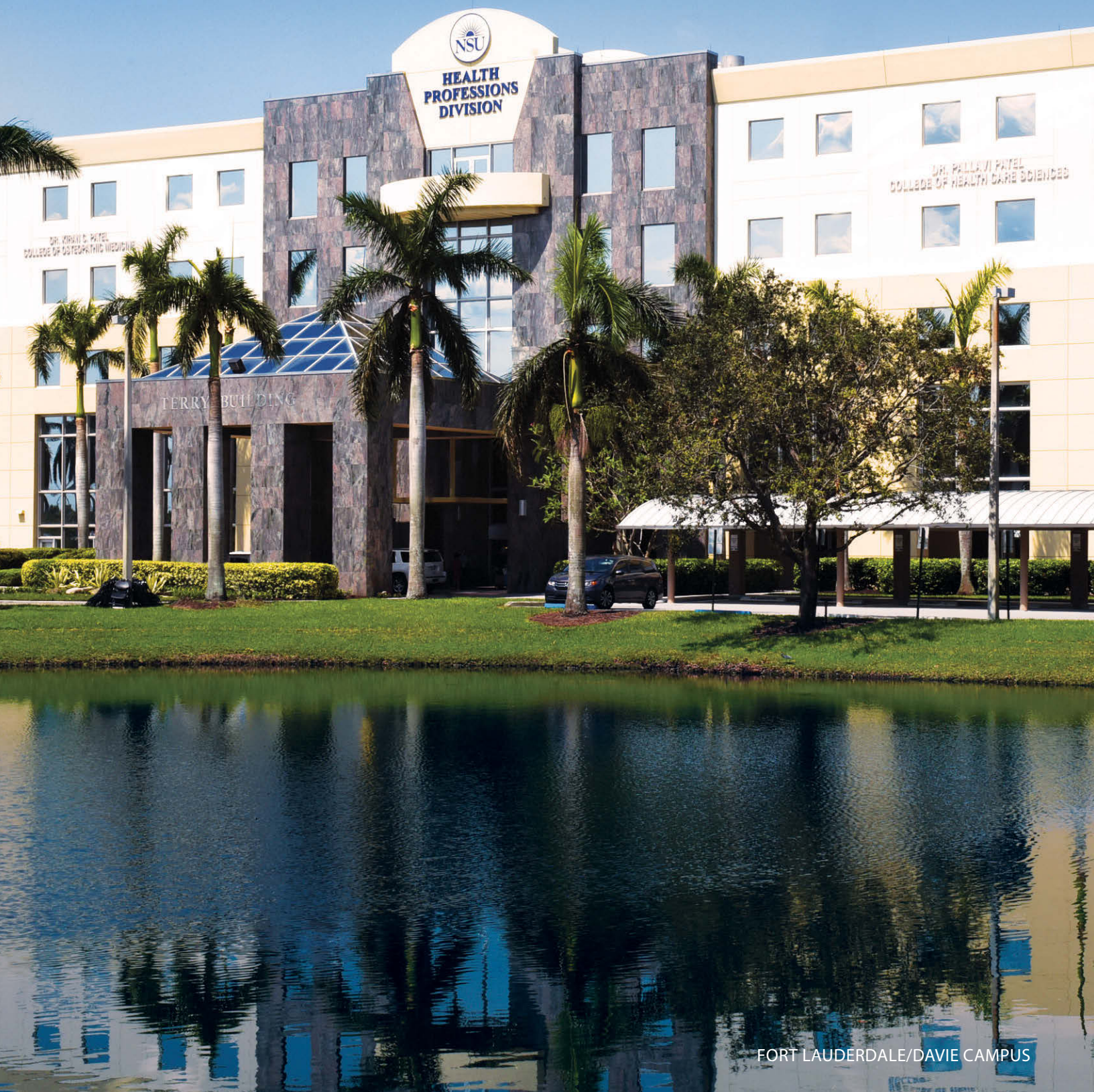
FORT LAUDERDALE/DAVIE CAMPUS

THE HEALTH PROFESSIONS DIVISION (HPD), with a student body of nearly 8,000, is home to eight colleges. Located on the Fort Lauderdale/Davie Campus, it occupies a $70-million complex, covering 21 acres. It includes eight buildings totaling more than 900,000 square feet of space for classrooms, laboratories, offices, the Health Professions Division Library, an outpatient health center, and a pharmaceutical care center. Several of the HPD programs are also located at our regional campuses in Fort Myers, Jacksonville, Miami, Miramar, Orlando, Palm Beach, and Tampa, Florida, as well as in San Juan, Puerto Rico. These campuses extend our programs and resources to various communities. They offer you the ability to complete a degree at a location that may be more convenient to your home.