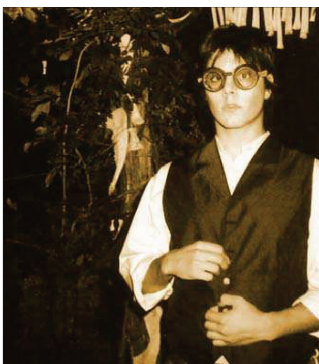
"Red Hunter (a.k.a Peter and the Wolf)"

in which his then girlfriend said he was like a bonsai tree because he always listens but he never learns. He seems upset about it at first, but then eventually, with his monotone voice and spotty ukulele, he seems so incredibly detached from the situation. It's almost as if the relationship ended and he just let it roll off of his