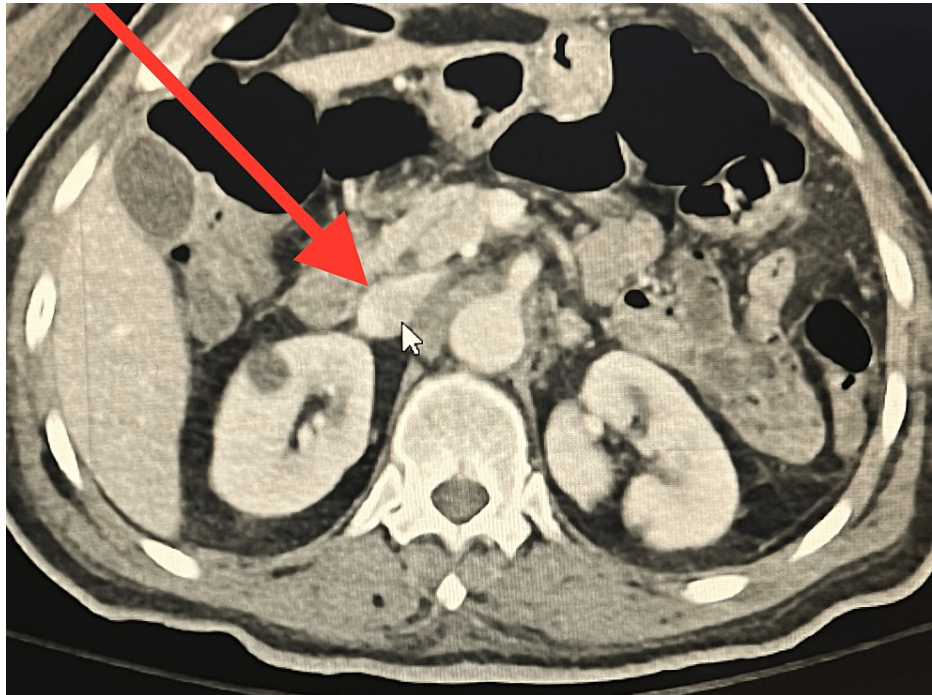
FIGURE 1: Abdominal CT scan showing distention of the right renal vein and significant distention of the suprarenal vena cava.

right kidney and distention of the right renal vein as well as significant distention of the suprarenal vena cava extending up to its junction with the right atrium. An underlying thrombus or mass was suspected. No discrete renal masses were noted within the kidneys.