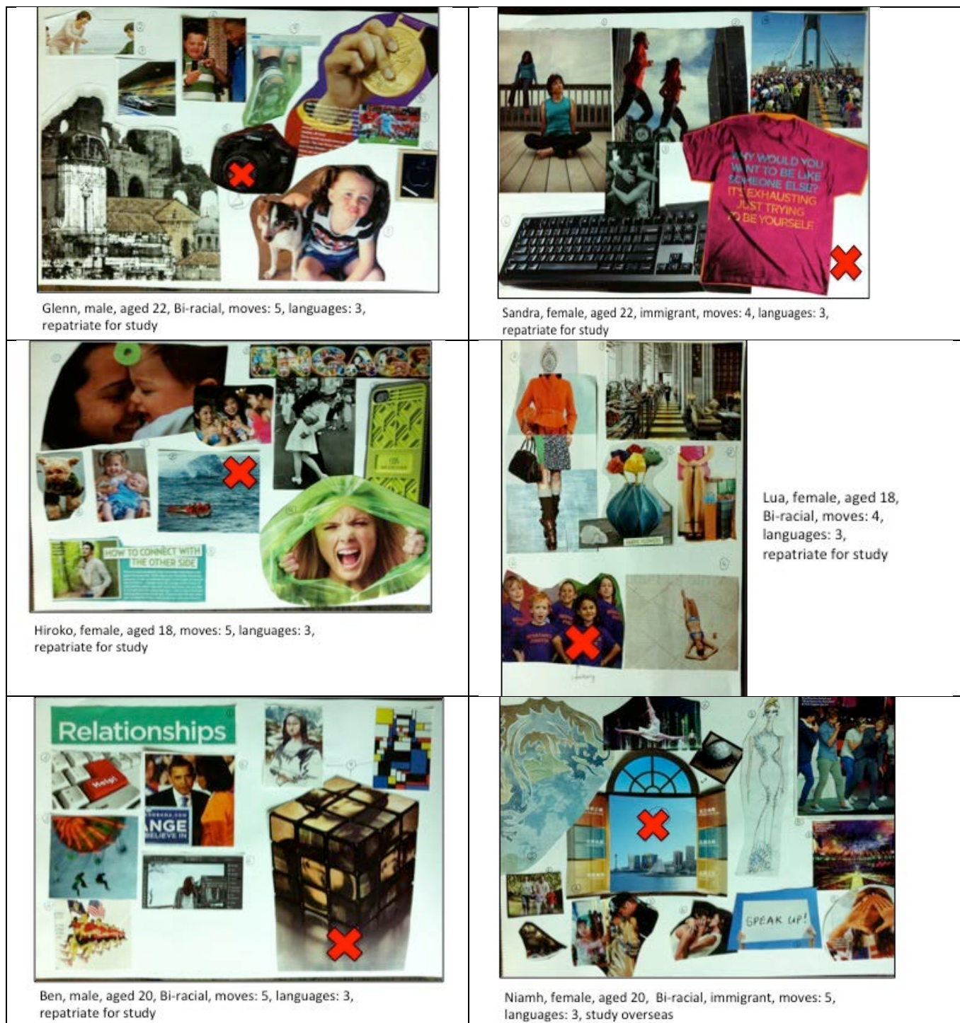
Figure 1. Collages from participants

Note: The red X indicates participants' self-positioning (CLET Step 3) on the collage. See also discussion of this aspect below.