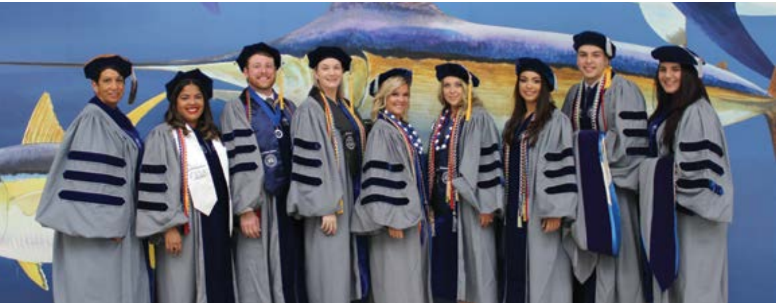
2019 J.D. with a concentration in Health Law graduates

Intellectual Property, Technology, and Cybersecurity Law —Focuses your learning on privacy, data security, and patent law, matching these strengths to the current substantial market need for intellectual property specialists. You will also learn to manage legal challenges from social media and computer hacking and explore patents, trademarks, and copyrighted work.