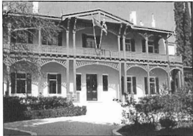
CAMPUS building where classes are held.

Student cohorts of 25 or more move through the program together to completion, which enhances the consistency, interaction and collaboration. The 10 core courses are followed by a capstone experience which applies elements of the curriculum to a significant research project.