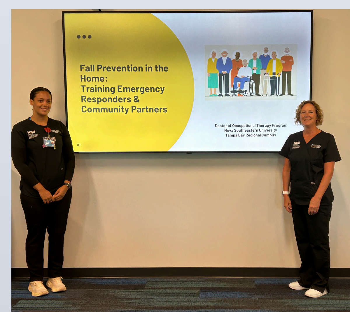
Figure 4. Dr. Kane and I presenting at Fall Prevention Symposium