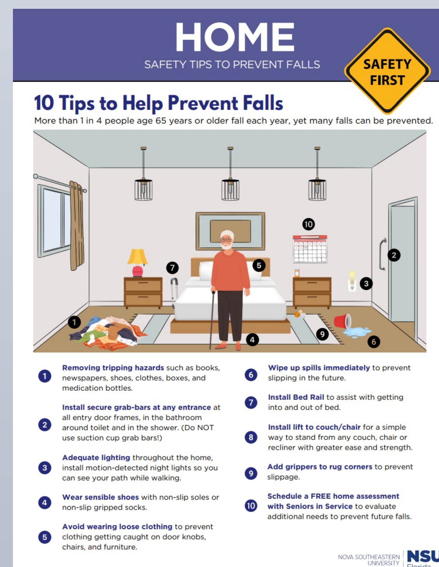
Figure 5. Fall Prevention resource for First Responders of Pinellas County