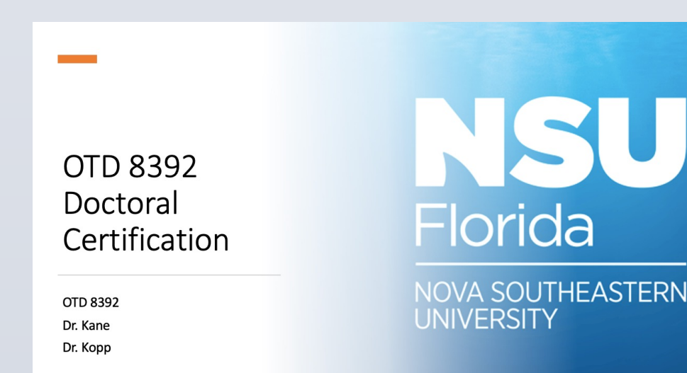
Figure 2. Updated PowerPoint of NBCOT information

A 16-week project focused on education and administration for acquiring in-depth knowledge of the updated ACOTE standards and assisting in developing and designing graduate-level assignments and outlines, as well as assisting in the teaching of the class of 2026 Capstone Seminar.