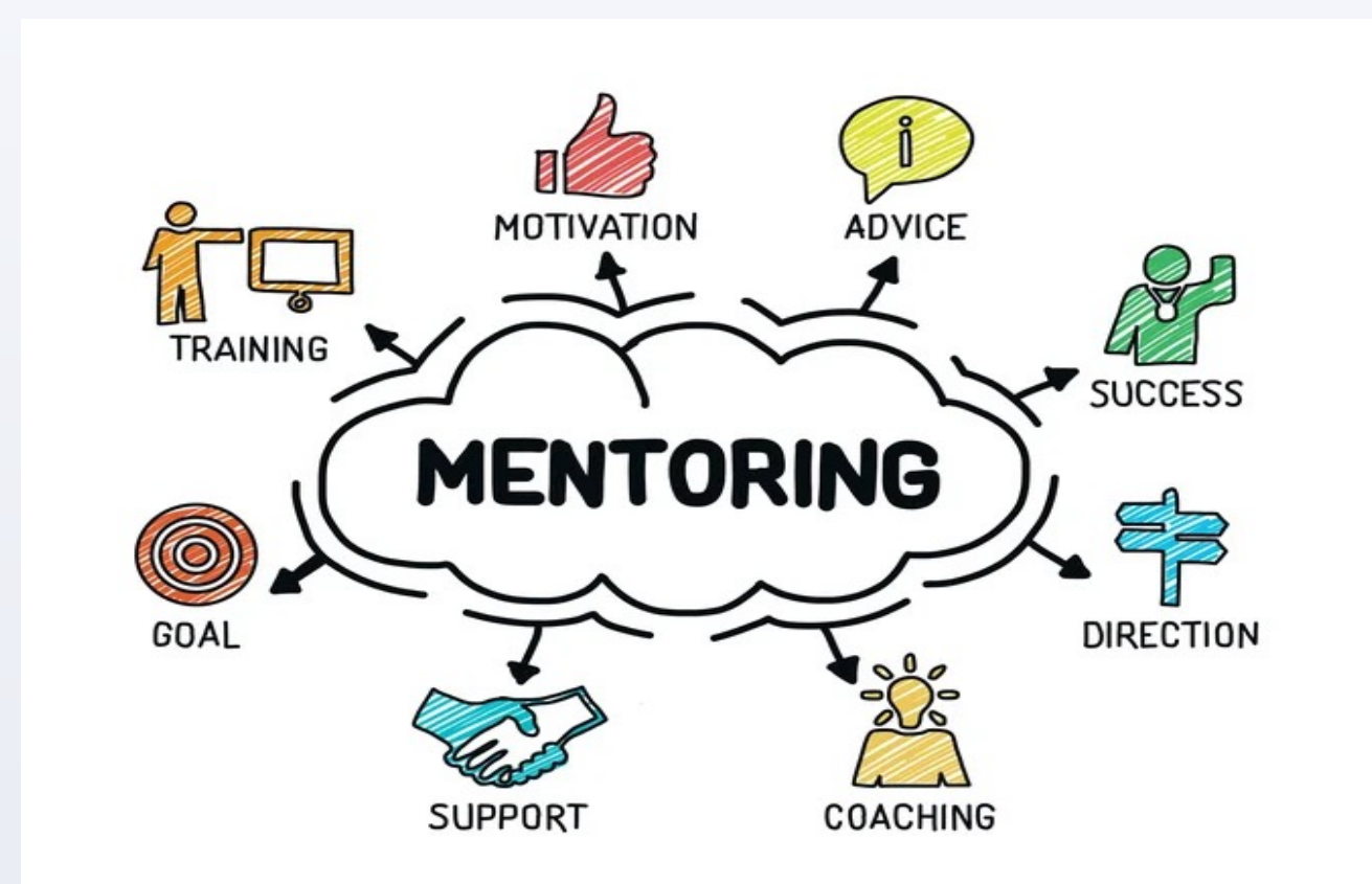
(Mentoring chart with keywords and icons, 2016)