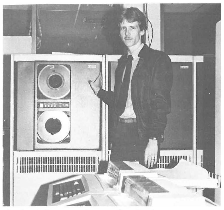
Nova's mainframe computer serves the university

Eighty hours of computer time are provided for each core course. Additional hours are billed at the rate of $10.00 per hour including phone charges. The hours of online operation are between 6 p.m. and 7 a.m. daily and all day weekends. In addition, all other courseware materials necessary to complete the program are included. Materials include study guides, reading assignments, computer protocols and user codes written assignments, and examinations.