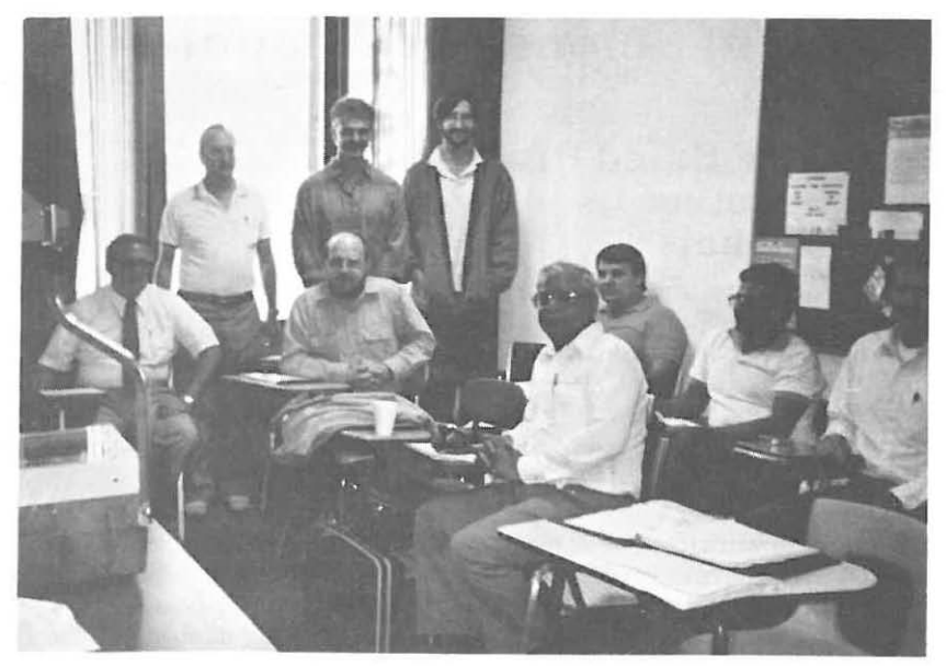
Doctoral students attending seminar