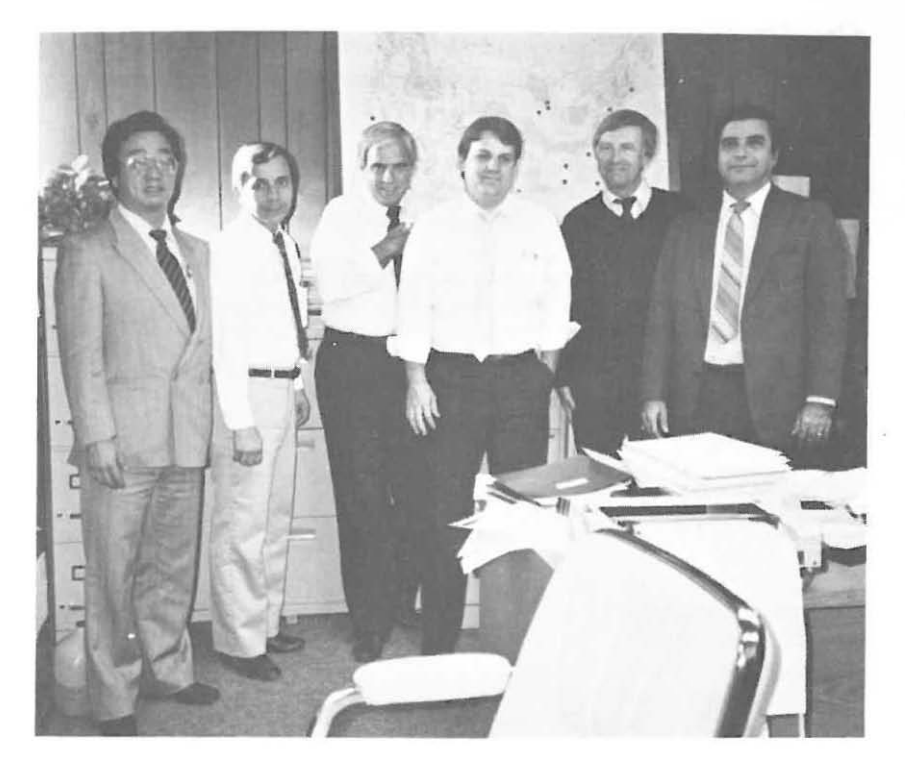
Staff members are dedicated to helping students