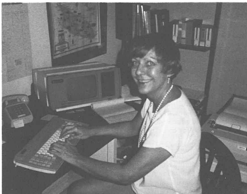
Waiting to go on-line.

A student whose VA educational benefits have been terminated for unsatisfactory progress may petition the school to be re-certified after one six-month term has elapsed. The school may re-certify the student for VA educational benefits only if there is a reasonable likelihood that the student will be able to attain and maintain satisfactory progress for the remainder of the program.