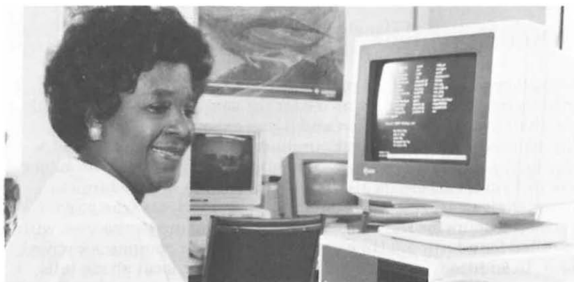
Interaction between student and computer.

Students who wish to withdraw from the program, either temporarily or permanently, must inform the Center for Computer-Based Learning Admissions Office in writing to be eligible for allowable refunds. Students will receive a full tuition refund if they withdraw before the first semester and have used no on-line computer time. If on-line time has been used, $7 per hour will be deducted from the allowable refund. Students who have paid tuition and withdraw after the first seminar will be entitled to a refund equivalent to the second quarterly payment, assuming that the second quarterly payment had been paid in a lump sum with the first quarterly payment, otherwise no refund will be given. If a region fails to form in the applicant's geographic area, all monies will be refunded (including the application fee). If an application is rejected, the $30 fee will NOT be refunded.