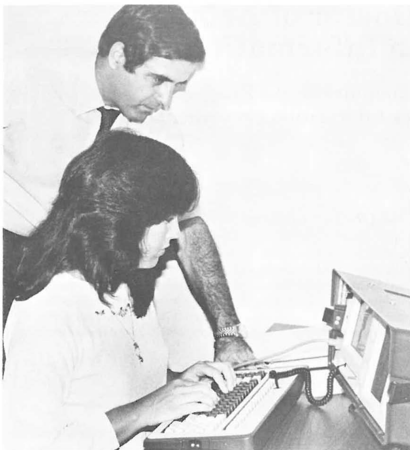
Interaction between student and instructor.

education, use their knowledge and experience to examine critically the "real world" efficacy of theory and practice presented through formal instruction and learned through independent study. And because of their status as practitioners, they have the opportunity (and are required) to submit to the test of reality newly acquired knowledge and competencies, through direct application within their own institutions or systems.