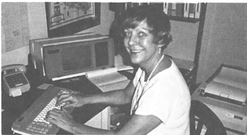
Waiting to go on-line.

In this course student work centers on relational database management systems design philosophies, data dictionaries/data directories, database administration, and database planning.