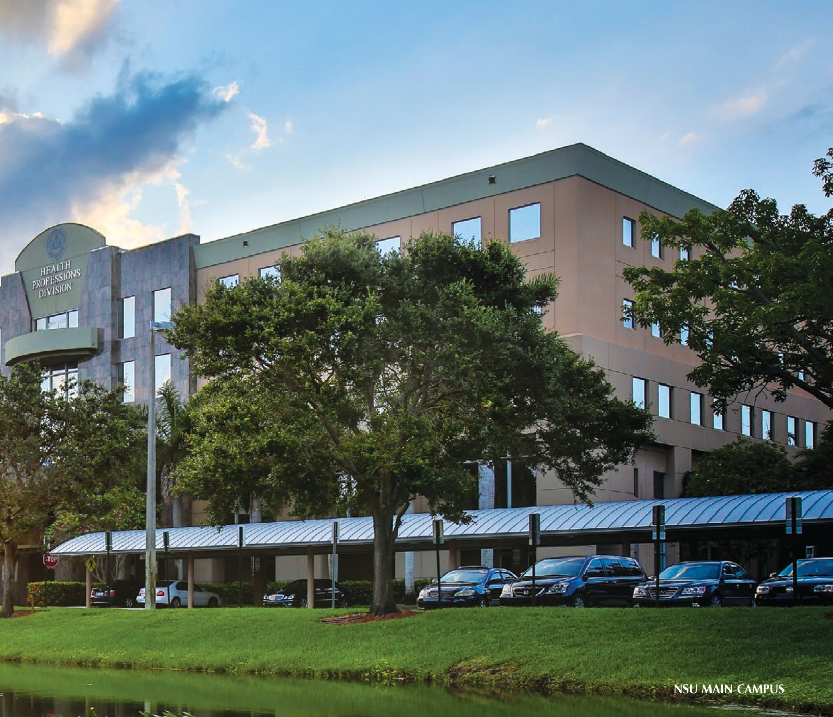
NSU MAIN CAMPUS

166,000 alumni and current enrollment of more than 24,000 students . Fully accredited by the Commission on Colleges of the Southern Association of Colleges and Schools, the university awards associate's, bachelor's, master's, educational specialist, and doctoral degrees in a wide range of fields including the health professions, law, business, marine sciences, psychology, social sciences, computer and information sciences, and education.