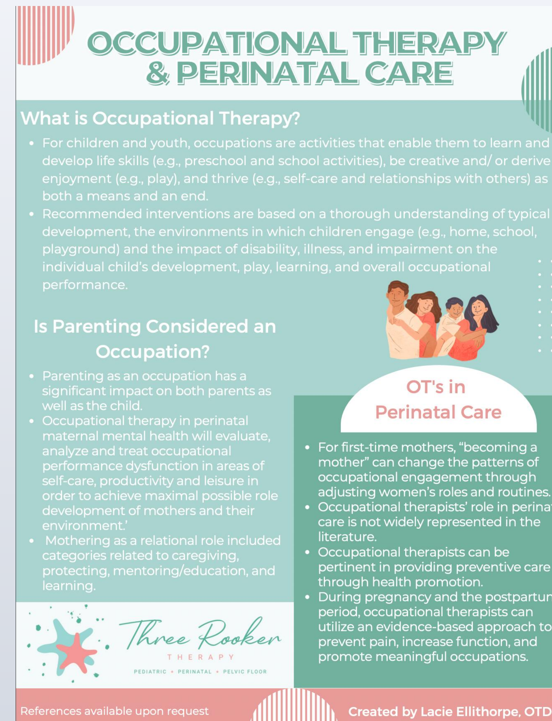
Figure 1 One of four fact sheets created for Three Rooker Therapy website to support video series