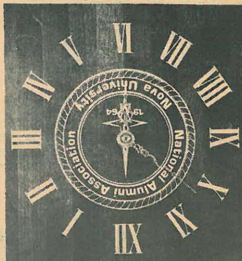
This walnut finished wood clock measures 11" by 11" and is battery operated.

Send your check for $35 (plus $2.50 for shipping), payable to Nova University, to the National Alumni Association, Nova University, College Ave., Fort Lauderdale, FL 33314.