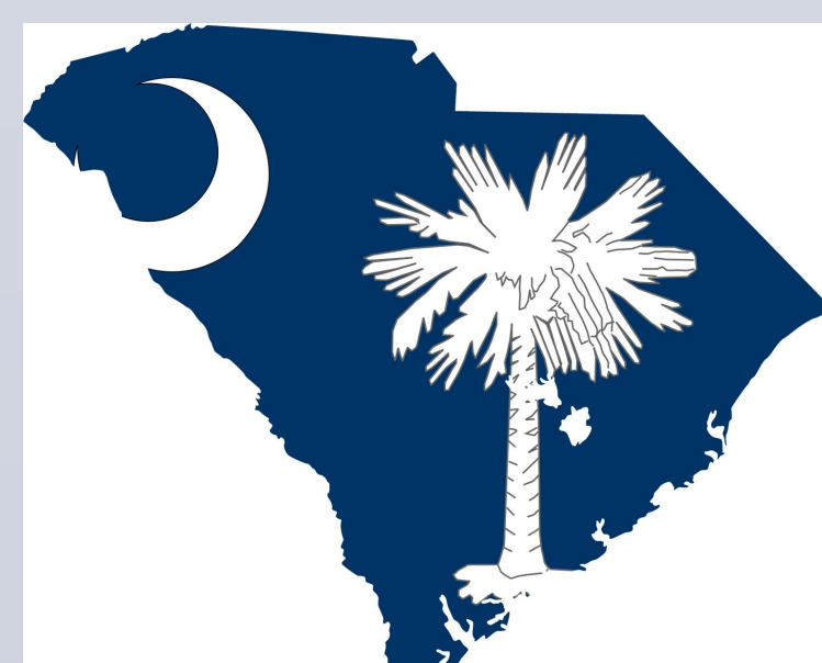
Figures 2: State of South Carolina with iconic palm tree and palmetto moon.