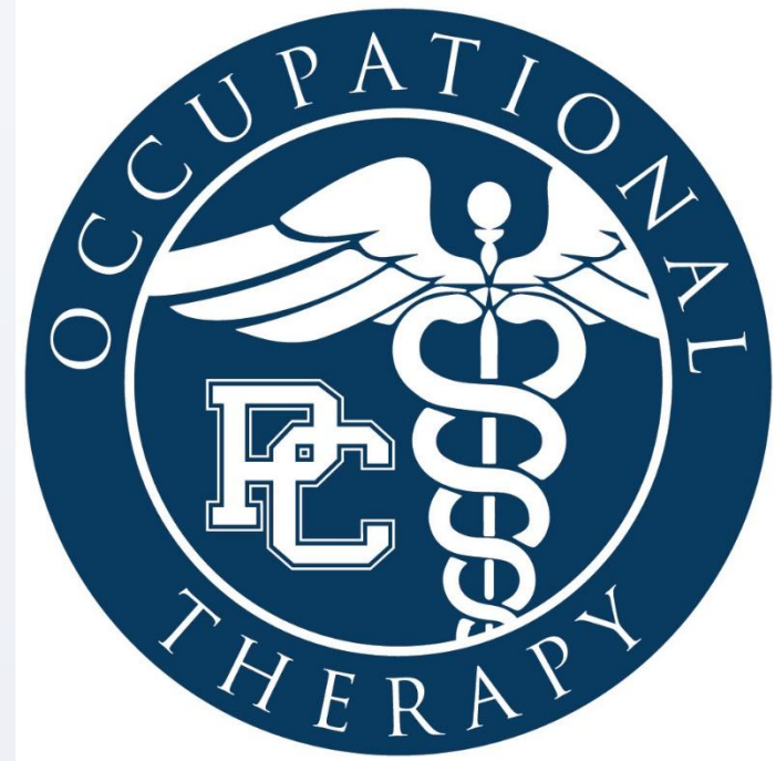
Figures 1: Presbyterian College final logo created.