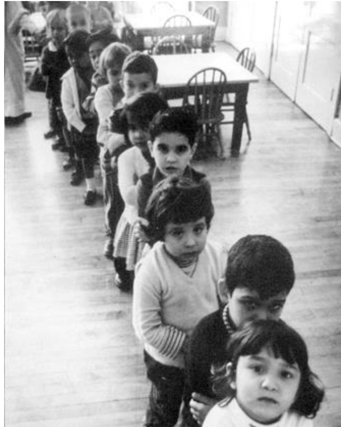
Figure 1: Cuban Pedro Pan Children lining up at an unnamed camp.

make the difficult decision of sending the boys alone to the U.S. via Operation Pedro Pan. Thus begins the second part of the book, which centers on Julian and his brothers' new life in the U.S.