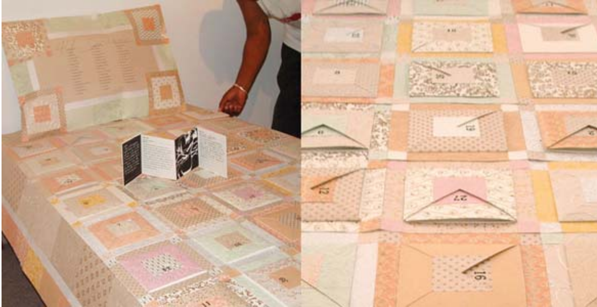
Figure 1 - Original "47 Dreams" Installation

Click on the quilt squares below to access the "47 Dreams" in digital format, or use the dream index below.