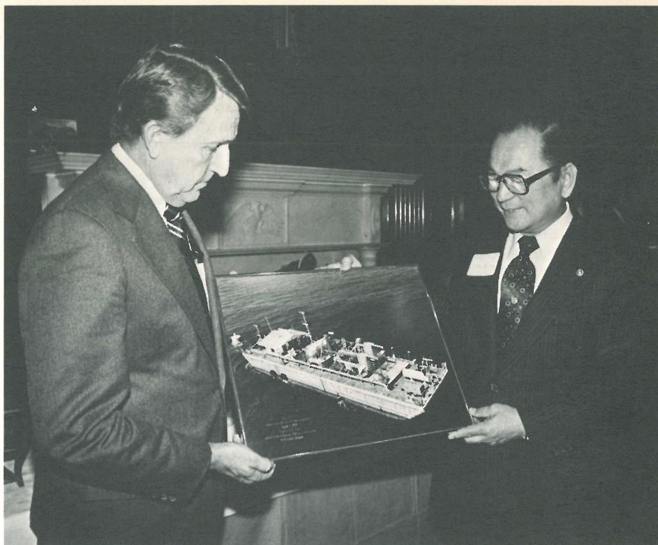
A photograph of Mini-OTEC received a lot of attention at the Matsunaga reception. Senator Dale Bumpers (D-Arkansas), left, and Senator Spark Matsunaga (D-Hawaii) admire the photograph. Bumpers is Chairman of the Energy Subcommittee on Parks, Recreation, and Renewable Resources.

Thus S. 1830 and H. R. 5796 are substantially the same, with the exception that the former authorizes less money, but in a one-year-earlier time frame. Also, the Senate version currently requires three years for DOE to present a concrete plan and program to Congress, but consensus