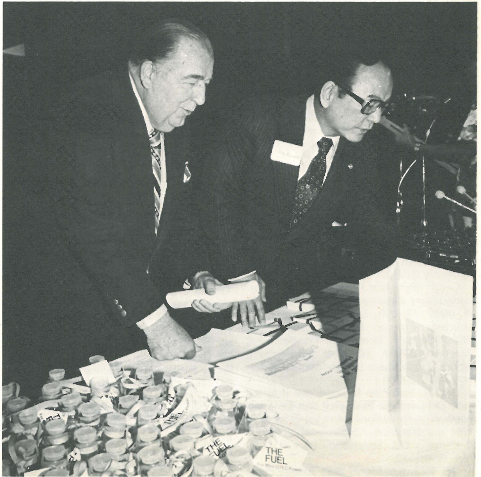
THE FUEL OF THE FUTURE: Senator Jennings Randolph (D-West Virginia), left, and Senator Matsunaga examine small bottles of water from the deep ocean and packages of OTEC-powered flashlights which were presented to the members of Congress who attended the Matsunaga reception following hearings on OTEC Bill S. 1830.

At the same time the reception was being held, in mid-evening, several roll calls were pending in the Senate chamber. An unusually high number of Senators were therefore present in the building—tired, hungry, and anxious for their day to end. Hawaiian music, refreshments, and pretty girls attending the reception were an appealing incentive for Senator Matsu-