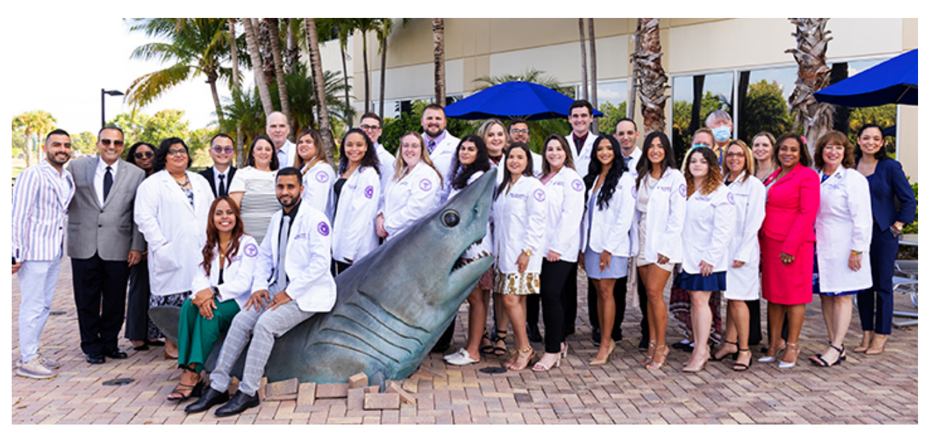
Palm Beach Regional Campus White Coat Ceremony 2022