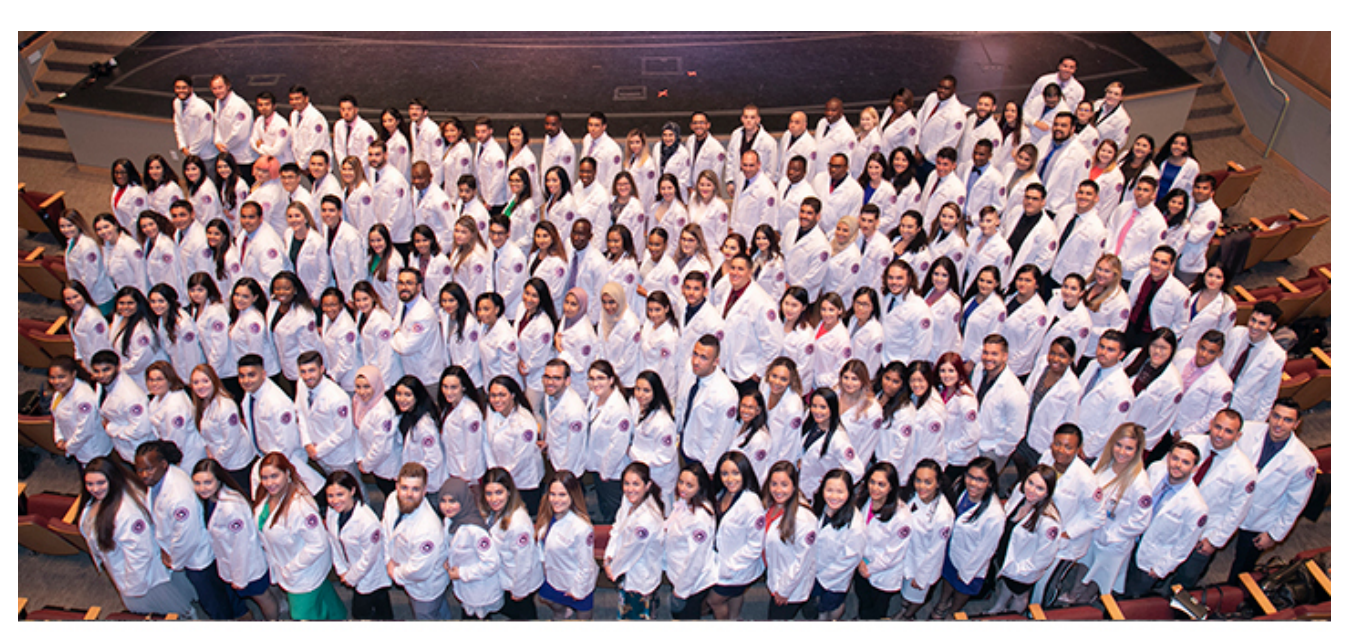
Fort Lauderdale/Davie Campus White Coat Ceremony 2022