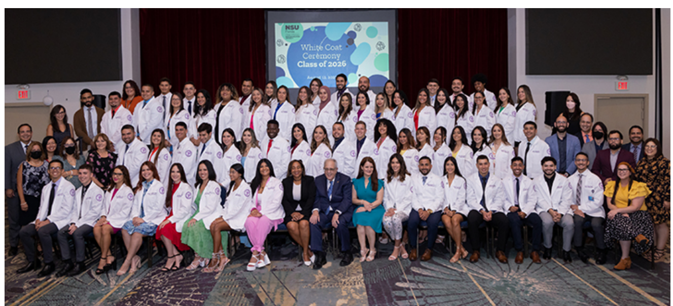
Puerto Rico Regional Campus White Coat Ceremony 2022

This was the first time in two years that the New Student Orientation program was conducted face-to-face and gave students an opportunity to mix and mingle with their classmates, faculty members, and administrators. Interactive sessions focused on the curriculum, assessment and exam policies, experiential education, team building, professional communication, and of course getting to know the current students and the many professional organizations!