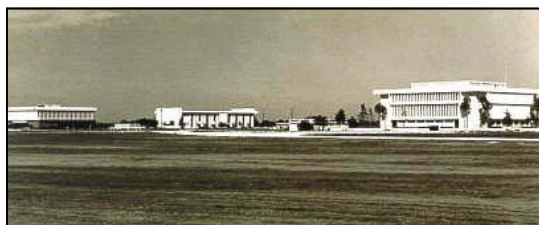
NSU is celebrating 40 years of excellence. Below is the NSU main campus then (left) and now (right).