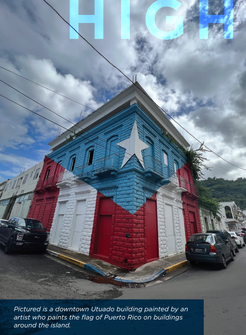
Pictured is a downtown Utuado building painted by an artist who paints the flag of Puerto Rico on buildings around the island.