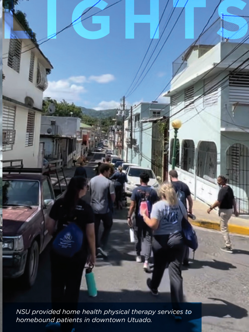
NSU provided home health physical therapy services to homebound patients in downtown Utuado.