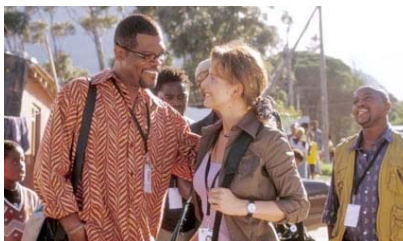
In My Country

The Shape of the Future tells the story of the first TV series ever simultaneously broadcast on Israeli, Palestinian, and Arab Satellite TV. The series explores—on a very human level—how Israelis and Palestinians might make peace. The emphasis is on building the future, not on reliving the past. The series delves deeply into each of the final status issues that divide Palestinians and Israelis: Security, Jerusalem, Palestinian Refugees, and Settlements.