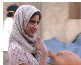
West Bank Story

This year's festival focused on films from or about Africa and the Middle East. The opening night film was Walk on Water . This enthralling award-winning film by internationally acclaimed director Eytan Fox explores the motives, strengths, and the humanity of an Israeli Mossad agent. Fox has a brilliant gift for putting people in moral quandaries where their responsibilities run counter to their instincts.