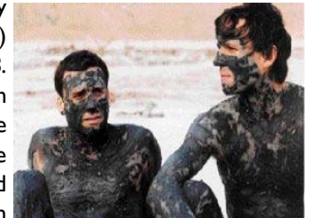
Walk on Water

The 5th Annual Common Ground Film Series sponsored by the Department of Conflict Analysis and Resolution (DCAR) and the Search for Common Ground was held June 14-28. What sets the Common Ground Film Festival apart from most film festivals and series is the way the filmmakers have chosen to tell their stories. The films that are selected are balanced in their portrayal of conflicts and issues; they avoid stereotyping by focusing on people as individuals rather than as representatives of a group; they promote understanding of the issues and people involved; they give audiences a broader context of the issues; and they show the commonalities among people while not ignoring the differences that divide them.