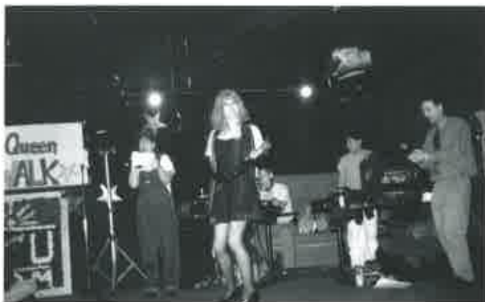
The Flight Deck Follies, a variety show with a "twist," is one of the popular fund-raising events sponsored by WRI.