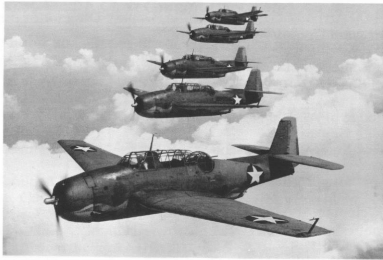
Units of Navy, Army, Coast Guard Scour Sea For Lost NAS Aircraft