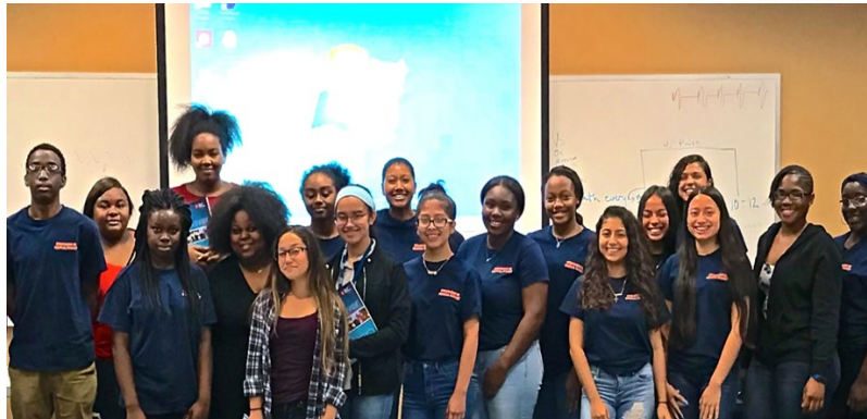
Students in the Stranahan High School STEM Seminar Series