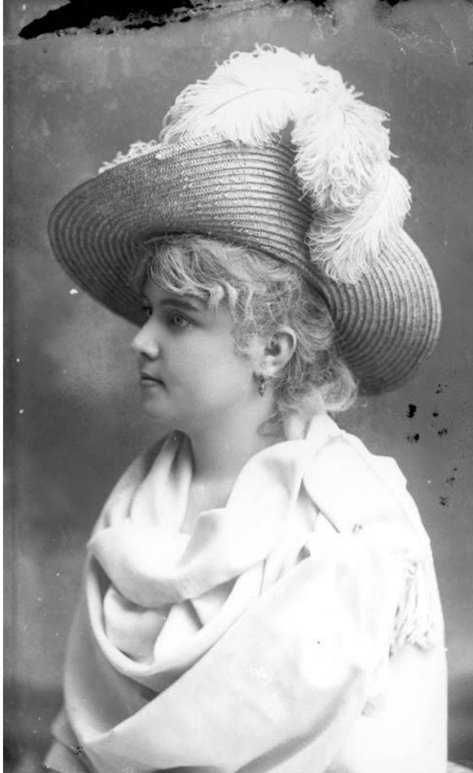
Figure 1: 19th-century woman in hat decorated with plumes from wading birds.