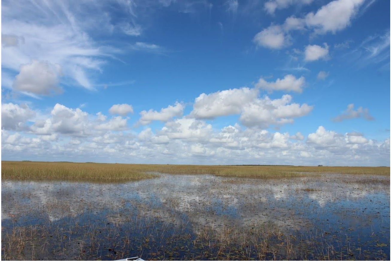
Figure 11: Everglades National Park.

The Everglades is a slow moving river, which flows from north to south due to a slightly lower elevation in the southern peninsula of Florida. The ecosystem is an oligotrophic system, which is defined by low nutrients. Large influxes of nutrients caused by runoff from surrounding agricultural areas lead to eutrophication and a subsequent change in vegetation from a sawgrass dominated landscape (pictured above) to one dominated by cattails, which degrades the quality of the habitat for the native fauna. In order to protect the Everglades from these impacts, the largest created wetlands in the world have been established, known as Stormwater Treatment Areas, to remove these excess nutrients before the water reaches the park.