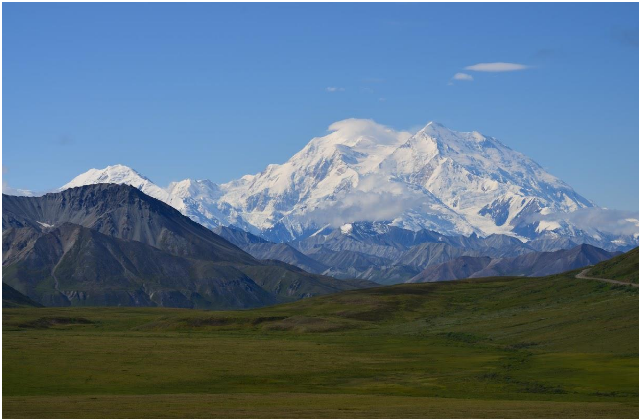
Figure 4: Mt. McKinley.

“The mountains are calling and I must go.” – John Muir