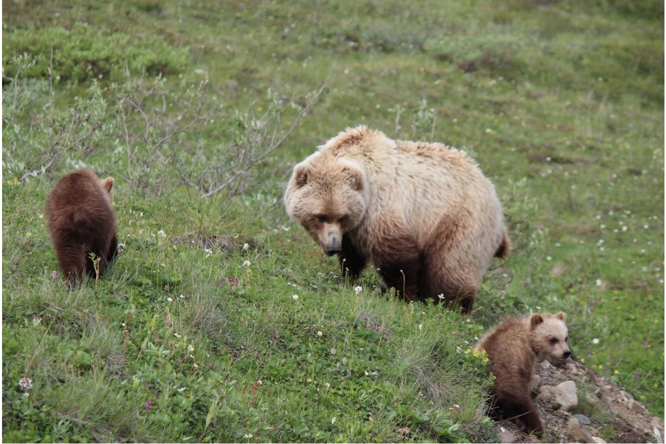
Figure 10: Brown bear sow and cubs.

Most people who see a brown bear, Ursus arctos , in Alaska would say they saw a grizzly bear. However, grizzly bears are specifically an inland population of brown bear with no access to protein-rich salmon and thus are generally smaller, averaging about 500 lbs. The cubs seen here crossed the park road a few feet from our van while exploring Denali National Park. They will stay with their mother for approximately two years and begin bulking up for the upcoming winter by feeding nonstop on available berries and roots, a process called hyperphagia.