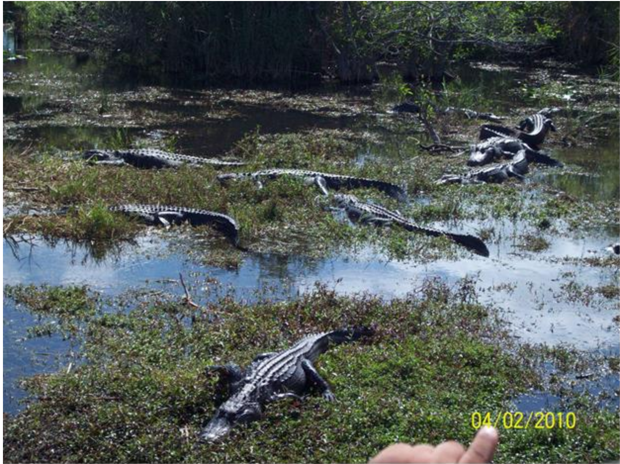
Figure 12: American alligators along the Anhinga Trail.

Visitor's to Everglades National Park hope to experience the thrill of seeing an American Alligator, Alligator mississippiensis . One of the best times to do this is during the dry season, when they aggregate in deeper areas known as sloughs. At the end of one of the boardwalks along the Anhinga Trail is the "alligator lounge" where many gators are spotted and the roar of males can be heard during the mating season. In the 1960's, the American Alligator was threatened to near extinction due to hunting for its skin and other human-related impacts. After protection under the Endangered Species Act its populations rebounded and the American Alligator was removed from the protected list in 1987.