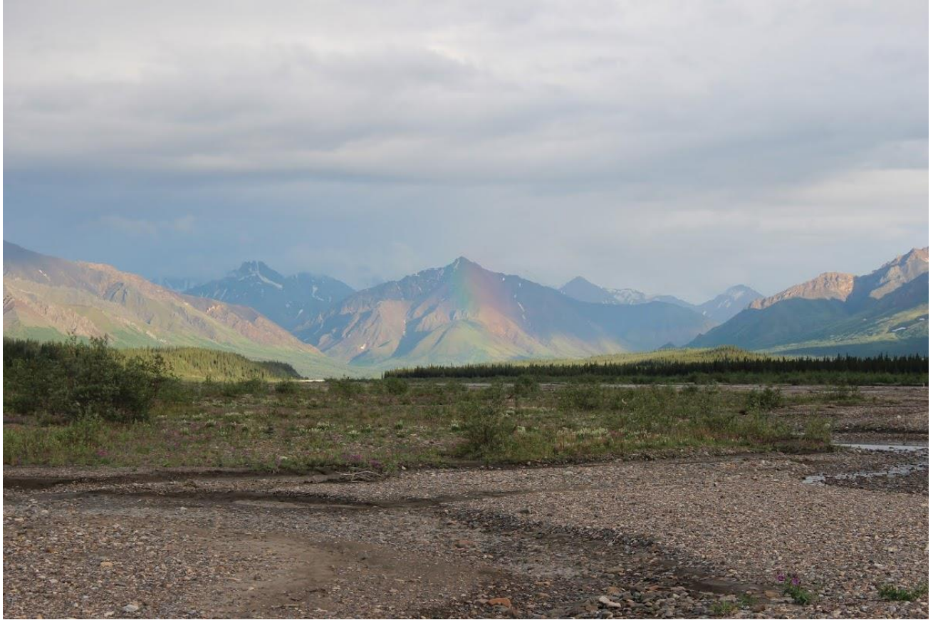
Figure 8: Land of the midnight sun.

This picture was taken at 11pm. Typically, we have 19-20 hours of daylight during our trips to Alaska. While searching for wolf, moose, and caribou tracks along the Teklanika River in Denali National Park, we were provided with the colorful display of a rainbow over the Alaska Range.