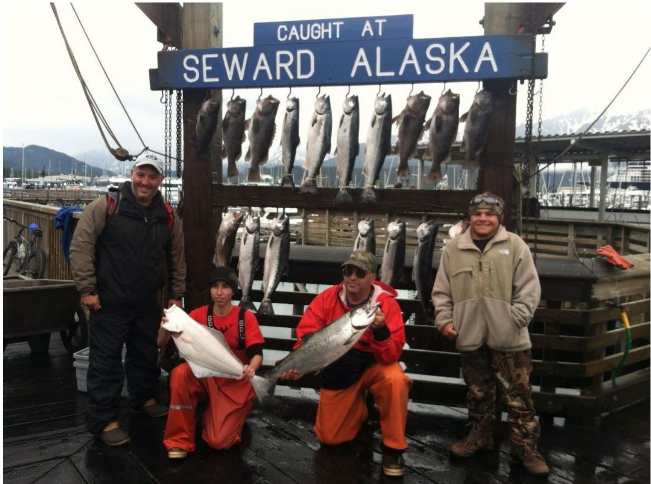
Figure 9: Alaska, a fisherman's paradise!

Typically, there is a reason the activity is called fishing and not catching. In Alaska, however, the reverse is true, and your day on the water is typically over because you have reached your quota. Salmon, rockfish, cod, and of course halibut are common species caught during a day at sea. Pacific halibut are the largest flatfish in Family Pleuronectidae and can reach over 8 feet in length and over 500 pounds! These monsters are called “barn door” halibut. Unfortunately many of these behemoths have been overfished and a common catch consists of “chicken halibut” pictured above left.