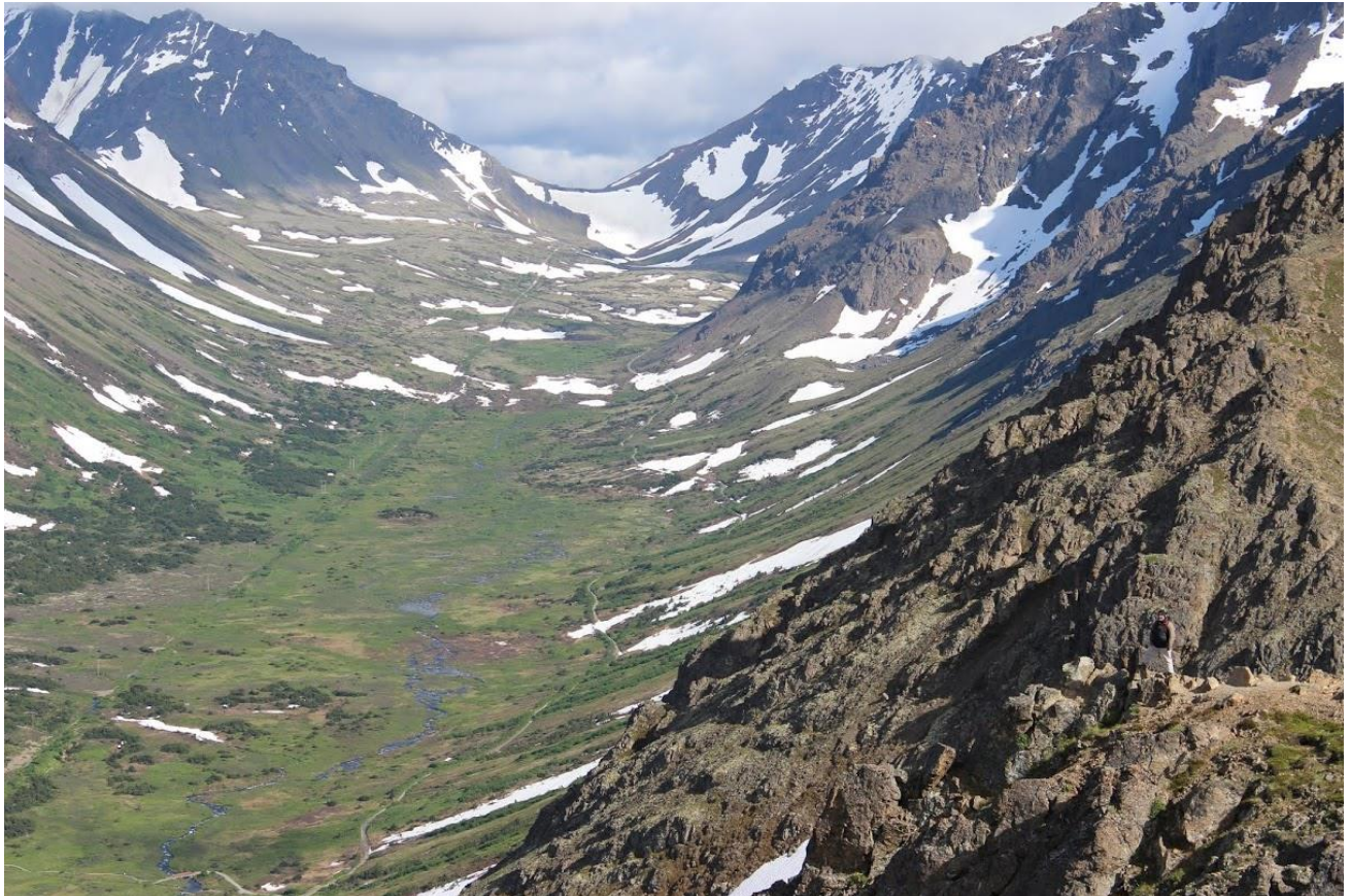
Figure 5: Flattop Mountain.

Mt. Everest sits on a much higher plateau and has a rise of \sim 17,000' . The native Athabascans gave it the name “Denali” which means the high one. Only 30% of all visitors to the park actually see this amazing wonder of geology, as its sheer height caused it to interact with upper level winds creating clouds which obscure it from view the majority of the time. The large dark mountainous feature to the left is actually the terminus of the Muldrow Glacier which originates on Denali’s northeast side.