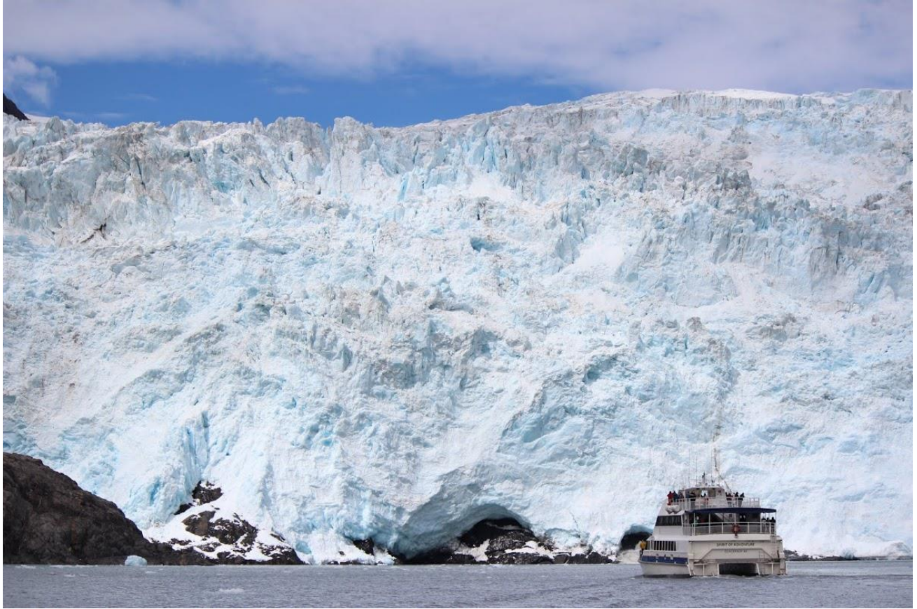
Figure 7: Aialik Glacier, Kenai Fjords National Park.

So this is where Superman's Fortress of Solitude is located! Aialik Glacier, Kenai Fjords National Park. Alaska has 100,000 glaciers – more than the rest of the world combined. Many are receding at an alarming rate due to accelerated climate change. As we idled nearby we could hear the constant cracking of the glacier as it melted, and at times large sections of the glacier would break free and crash into the surrounding waters forming new icebergs, a process known as calving.