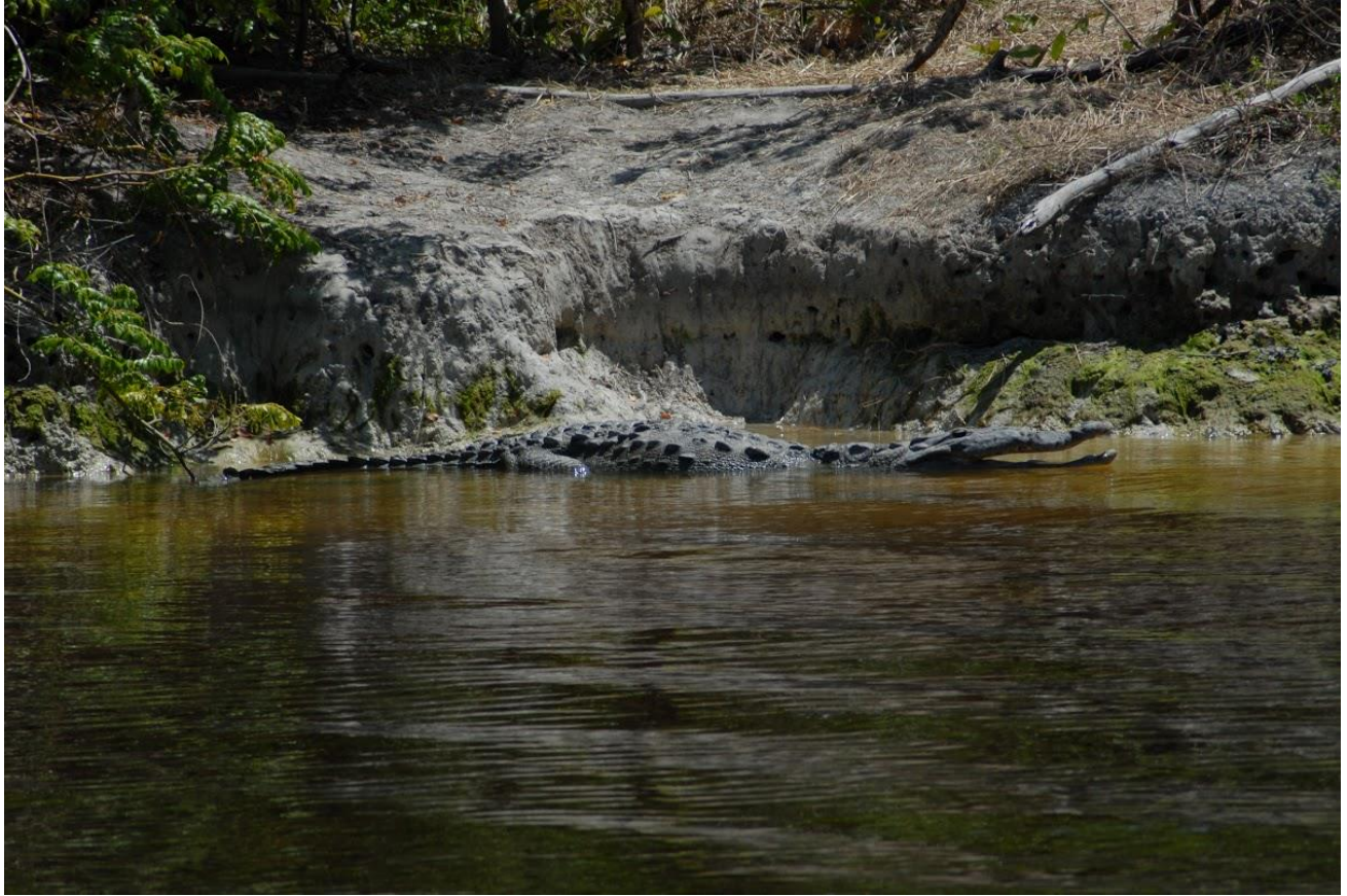
Figure 13: The American crocodile.

Another crocodilian species in ENP is the American Crocodile, Crocodylus acutus . This is the only place in North America where crocodiles are found, and South Florida is the only place in the world where both alligators and crocodiles can be found in such close proximity. In ENP alligators are generally restricted to freshwater areas, while crocodiles are found in saltwater areas. The crocodile above was observed at the end of the park road in the Flamingo marina estuary.