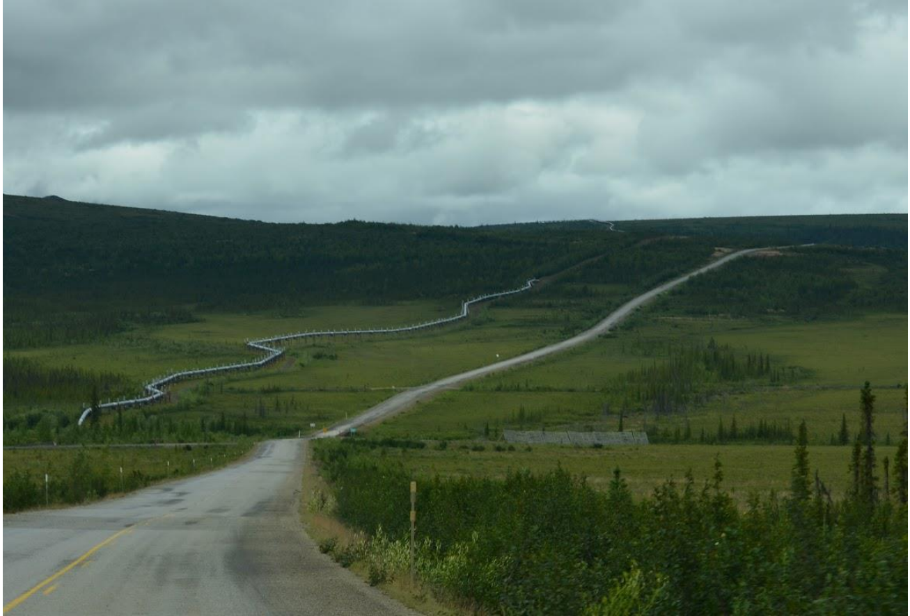
Figure 3: The Trans-Alaskan pipeline snakes across the Alaskan landscape.

The oil and gas industry is intricately tied into the Alaskan economy and its residents' quality of life. Approximately 93% of Alaska's General Fund ($8.86 billion in fiscal year 2012), which covers education, transportation, public health and many other important services is provided by the oil industry. Widespread opposition to the pipeline establishment led to another benefit to Alaskan residents, the Alaska Permanent Fund. Twenty five percent of all oil revenues made by the industry would be paid into this fund for future generations, who would no longer have oil as a resource. A dividend is paid to each Alaskan citizen each year and it averages around $1,000 per person. As we have witnessed recently closer to home, the acquisition and transport of oil is risky business and accidents can occur, leading to disastrous results such as the Deepwater Horizon Spill and the well-known Exxon Valdez Spill. Oil spills and mining-related activities cause the most devastating impacts to Alaska's natural ecosystems, rather than urban development which is more prevalent in South Florida. Urban development is less of a problem for Alaskan ecosystems due to the fact that Alaska is the third least populous state in the country. There are more