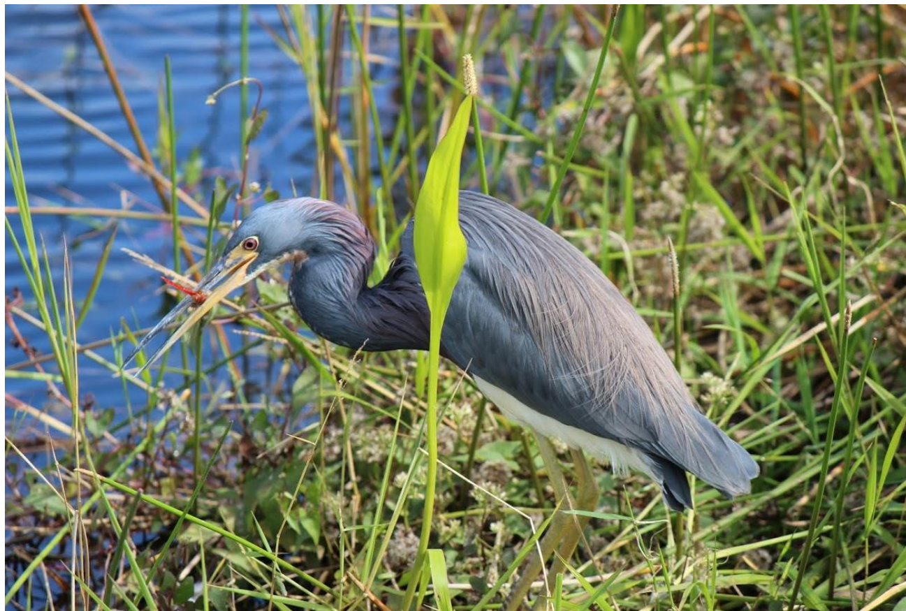
Figure 15: Tricolored heron.

This red-shouldered hawk provided us with a wonderful feeding display while hiking the Guy Bradley Trail along Florida Bay. It swooped over our heads, captured a flying grasshopper in midair and perched directly above us. It made a quick meal out of this insect after it tore off most of its wings and appendages and flicked them towards us.