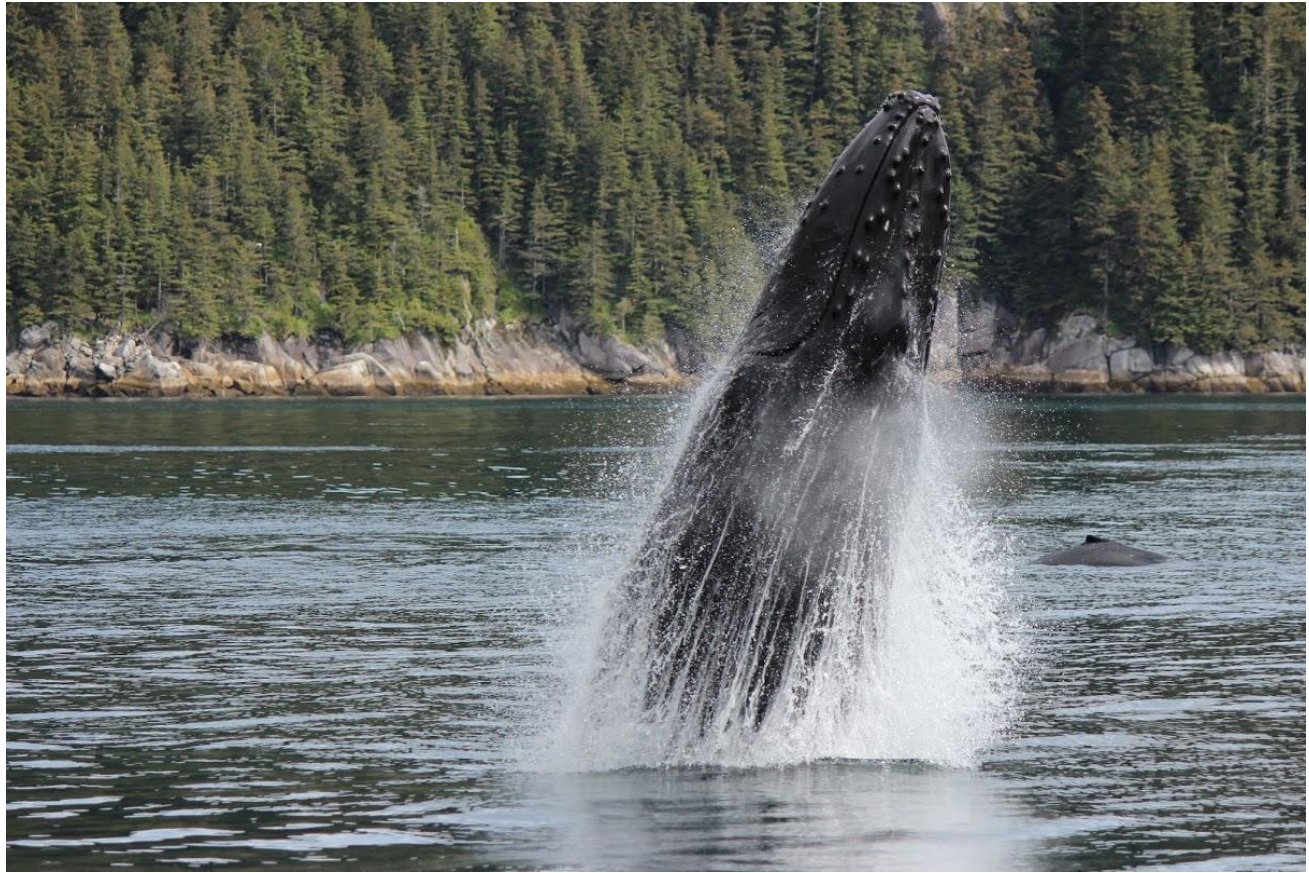
Figure 6: Humpback whale breaching.

We spent 30 minutes watching this humpback whale, Megaptera novaeangliae , and her calf performing what seemed to be at times synchronized swimming behaviors in Kenai Fjords National Park. They were lobtailing, flippering, and tail slapping, behaviors which may be related to dominance or mating. These baleen whales have a pretty good life spending their winters in Hawaii, where they breed and calve and then migrate to Alaska to spend the summer feeding primarily on abundant krill and schooling fishes. The final act of this spectacular show was a stunning breaching display only thirty feet from our vessel!