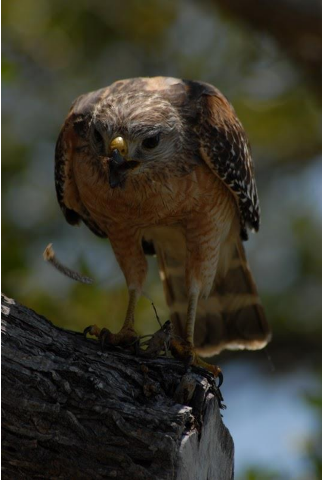
Figure 14: Red-shouldered hawk.