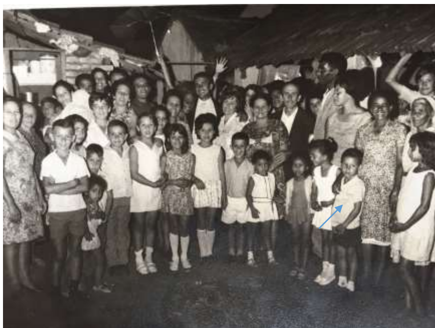
Figure 1. My Brazilian community in Conquistinha (1970).

able to go to school and I can also find a job,” mum continued. I was totally, oblivious of the poverty around me, for me this place was a paradise. I could not fully understand why we had to leave Conquistinha.