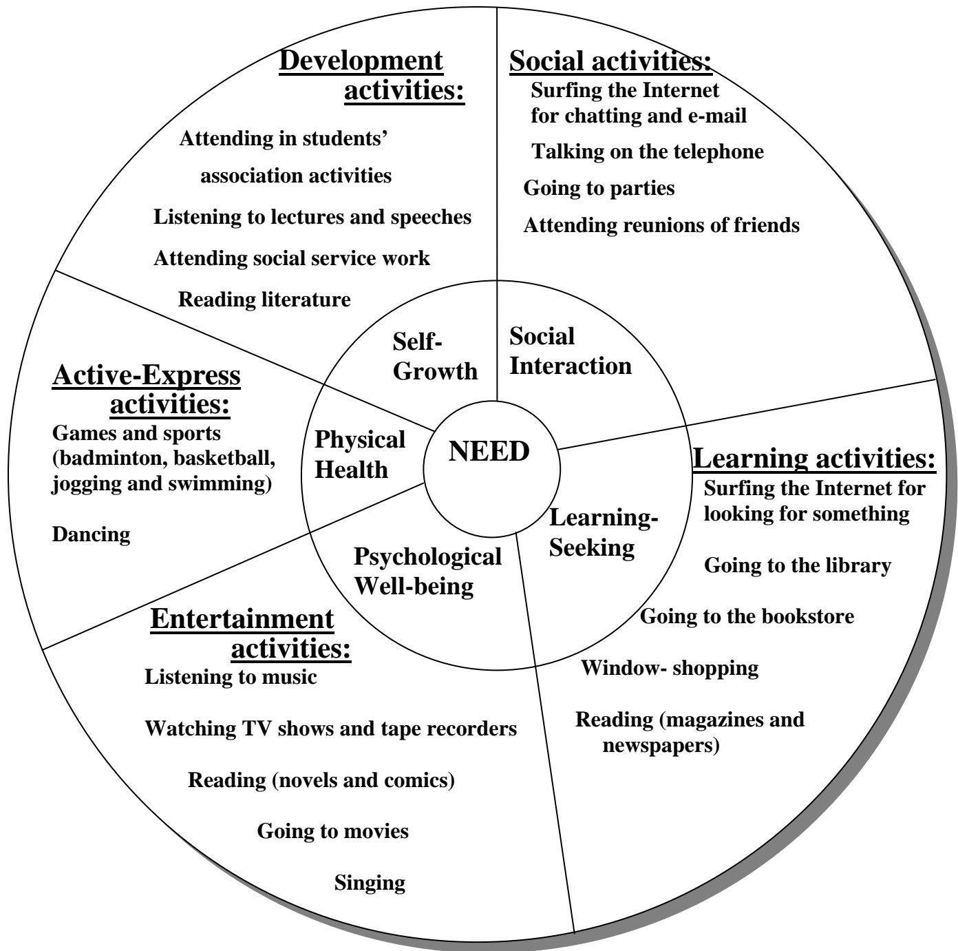
Figure 1. Conceptual Framework of Needs-Guided Leisure Attitudes.