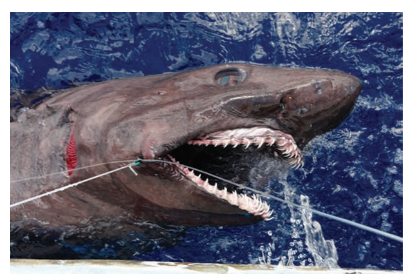
Figure 1. Lateral view of a bigeye sand tiger Odontaspis noronhai captured and released in western North Atlantic in March 2008, showing hooking location and gross anatomy of head. White strip along bottom margin of photo is side of capturing vessel.

with the ventral edges terminating just below the insertion of the pectoral fin. The first dorsal fin origin was distal to the posterior insertion of the pectoral fin.