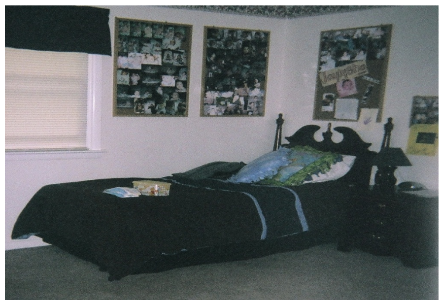
Figure 3: My Room

These photos represented the need for youth to have an outlet for relaxation. Youth identified places and activities that allowed them to be free from the stresses in life.