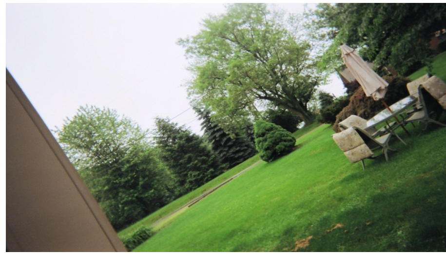
Figure 1: Outside

"We need to go out into the real world and get a good look at life ahead and out of foster care."