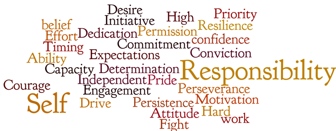
Figure 2: Sub-theme II model of student personal attributes for success.

Critical to the success of Indigenous students, irrespective of the available support, was timing. This included the timing of undertaking the nursing course and studying in relation to their family and community roles and responsibilities. Timing also extended to the complexity of their social needs such as housing, income, and childcare, and the personal health of the students, their families, and communities. “There’s [sic] certain social reasons ... they’ve just been on struggle street, you know, emotionally for so long that it becomes overwhelming. And sometimes, time is the only thing that helps” (IA).