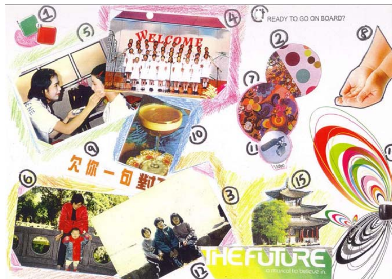
Figure 1. Example of a collage constructed in a CLET project with first-year psychology students.

Clusters of meaning provide a coherent way of organising data (both verbal and non-verbal) in relation to specific research questions including, for example, significant attachments to people (the social self), to objects-in-the-world, and to life events and support the sense-making process. The following phases support the sense-making process (elaborated below):