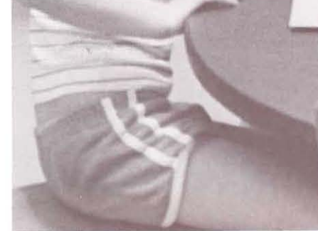
Therapy in Action.

Scheduling for practicums and optional labs is arranged Mondays through Saturdays on an individual basis.