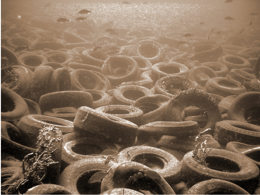
Figure 3: Tire field prior to clean-up, 2001.

Subsequent storms have deposited many individual tires from this field onto the beaches of Broward and neighboring counties. Those tires that have not washed up on the beaches are now scattered over this, approximately, 150,000 m 2 landscape (fig. 3).