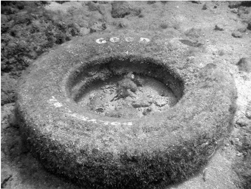
Figure 4: Tire showing original brand name and white wall. Photograph courtesy of Matthew Hoelscher.

The western edge of the tire field abutted the eastern edge of a natural coral reef that ranges in depth from 15m at the crest to 20m at the edge of the eastern face. Photographs and diver surveys of one site indicate that areas of live coral that made up the hard substrate around this site have been severely damaged. At the removal site tires were found to be mostly clean of any substantial growth. Many of the tires were clean enough to read brand names (fig. 4). The area was covered with tires three to five deep with the deepest layer buried in sand. Tires that were substantially buried in the sandy substrate were left in place (fig. 5).