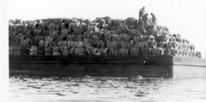
Figure 1: Tires bundled on barge in preparation for deployment, 1967.

including hurricanes, annually. During these tropical weather events wave action easily interacts with the substrate at the 20-meter depth. Over the past 25 years the constant dynamic interactions and stresses created by ocean currents and wave action have torn apart the Osborn Tire Reef and scattered most, if not all, of the tires over an area of approximately 300 x 500 meters.