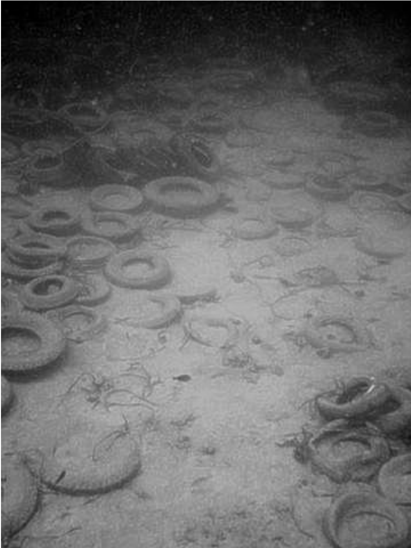
Figure 5: Photo of tires buried in sand, 2001.

During the course of the project an area approximately 20 x 20 meters was cleaned of loose tires. The western edge of the cleaned area was the fore reef slope and the cleaned site radiated out to the east. While clearing 250m 2 of tires from a 150,000m 2 site provides little restoration this project did bring a great